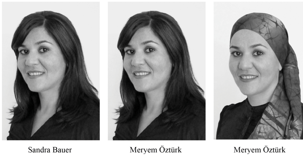
Fig. 1. Names and photographs, indicators for identity