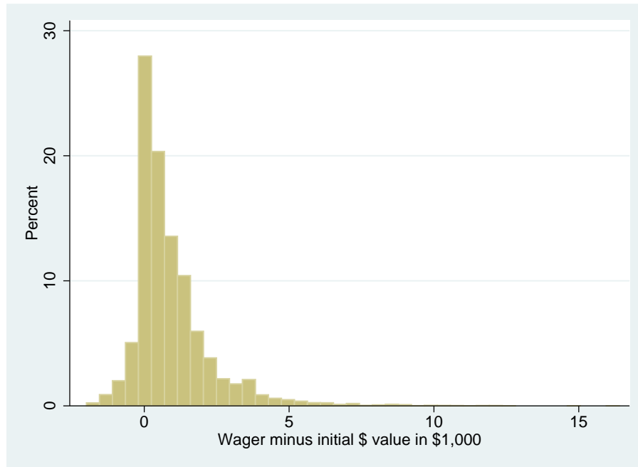
Figure 1: Distribution of actual wager minus initial $ amount of Daily Double clue (in $1,000).

Figure 1 provides a distribution of the difference between the realized wager and the corresponding initial dollar amount of all 12,596 DD clues. The pure correlation coefficient of these two variables reaches a value of 0.44 and Figure 1 confirms that an extraordinary number of wagers fall closely to the initial dollar amount. In fact, more than half of all wagers fall within $500 of the initial dollar amount and over 76 percent fall within $1,000, even though the maximum possible wager averages $5,914.