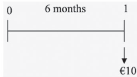
Figure 1. Expected pay-offs of the T-Bill.