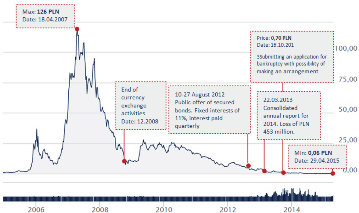
Figure 1. Gant Development S.A. share prices – from boom to bust