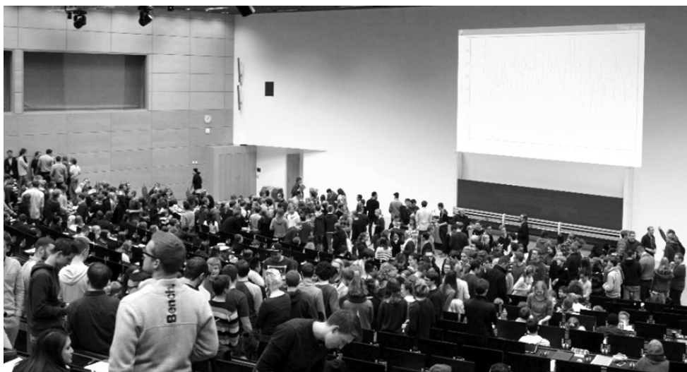
Figure 1: Pit Market at TU Dresden on November 24, 2015

process involving several hundred students, the outcome is quite surprising for most students. Once the trading has come to a halt, we show the supply and demand curves which result from the distributed tickets. The average price and the quantity traded are usually very close to the equilibrium values predicted by supply and demand curves. The classroom game can also be used for a lively discussion about the efficiency of markets or to show the consequences of taxes and regulatory interventions.