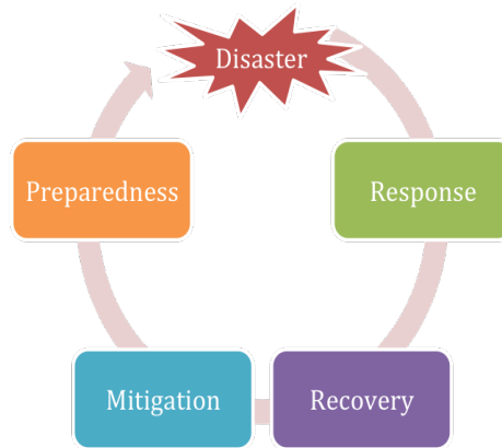
Figure 2. Disaster Management Life Cycle

It is difficult for the humans (individually) in proximity of a hazard to understand the warning about it, in certain cases though physical effects of the hazard may give people some signals/information about disaster, e.g. the advice given to the citizens of Hawaii about local tsunamis created by proximate earthquakes is: ‘Your feet are your signal; if you feel an earthquake, head for high ground’. Though these natural sensing capabilities provide disaster warning they cannot be taken as the most appropriate technique for disaster warning in today’s world where technology is progressing rapidly (Samarajiva, 2005). Researchers have taken unremitting efforts in asserting ICT enables to alleviate the influence of the disasters or crises during the entire disaster management cycle, for example, the early warning systems which can bridge the traditional and new media. And further in the disaster management cycle, ICT is being used in all the phases, but the usage is more apparent in some phases than in the others (Wattegama, 2007).