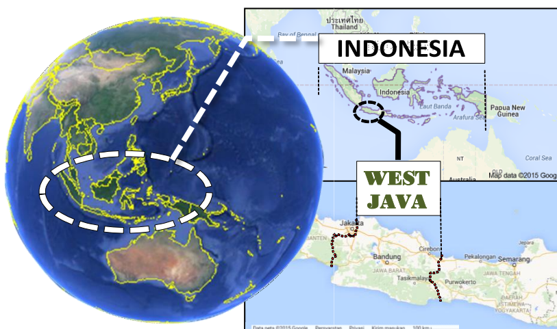
Figure 1. Index map of Indonesia and West Java Province