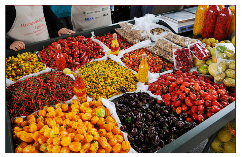
Farmers' market (CEASA), Distrito Federal, Brazil, 2015 <a href="https://goo.gl/sZ7V7x">https://goo.gl/sZ7V7x</a>>.

traditional peoples and communities. Among the policies discussed in REAF's meetings, related workshops, training courses and cooperation programmes, a few worth mentioning are access to land, institutionalised public purchase of food produced by family farmers, and support to rural women's production.