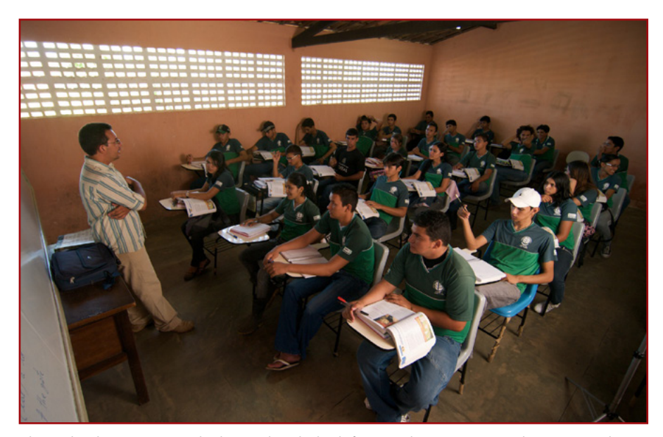
Federal Agrotechnical School of Crato, in the Umirim municipality, Ceará, Brazil, 2010.

and quality of life (housing, sanitation, electrification, communication, access roads, as well as access to health care, education and social assistance); productive inclusion and local development (technical assistance and other public policies for family farming specifically tailored to quilombola communities); and rights and citizenship. According to SEPPIR (2015), 168 quilombola areas had had their identification and delimitation reports concluded by 2014, benefiting 23,000 families over an area of approximately 1.7 million hectares.