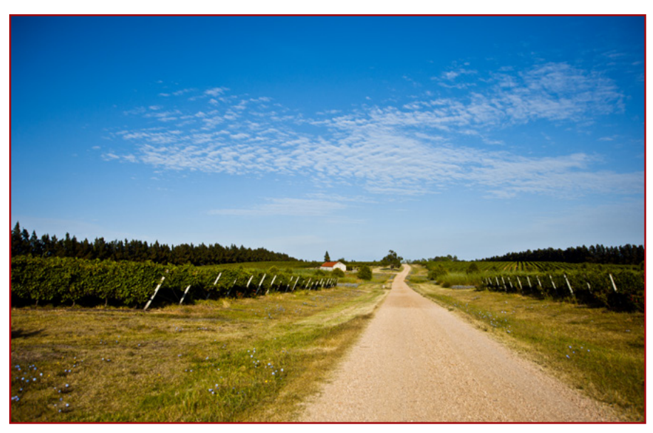
Canelones, Uruguay, 2013 <a href="https://goo.gl/cefU8">https://goo.gl/cefU8</a>>.

In the MDRs, all actors participate on behalf of organisations and institutions, not as individuals. They meet on a monthly basis, with sessions assembled by ETDR officers, usually through email or mobile phone. According to MGAP,7 there are currently 40 MDRs in operation throughout the country, with between 370 and 480 civil society organisations taking part. Participation is dynamic, meaning that some organisations are permanently involved while others only intermittently so, since the Committees are both an open as well as a relatively new institutional space still under construction. The MDRs are categorised as either 'fixed'—with meetings always held at the same location—or 'itinerant', whereby the venue is periodically changed to facilitate accessibility to some of the participants.