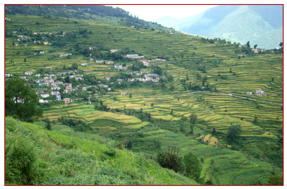
A panoramic view of the landscape showing settlements, land holdings and forest linkages, Himalaya region, 2007.

Some of the changing conditions that smallholders are facing include: the challenges of declining crop yields; the expansion of agriculture on marginal land; overexploitation of forests and rangelands; weed infestation; loss of crop diversity; soil erosion; hydrological imbalances; and social disintegration (Maikhuri et al. 2015). These drivers of change have raised questions about the sustainability of smallholders living in the mountains, limiting the options available to the farming communities and driving farmers—particularly male household members—to migrate to urban centres to seek off-farm jobs. Breaking this vicious cycle requires robust institutions, fair policies and adequate incentives to upgrade the quality of livelihoods, and appropriate research-based technology and innovations to revive traditional farming systems.