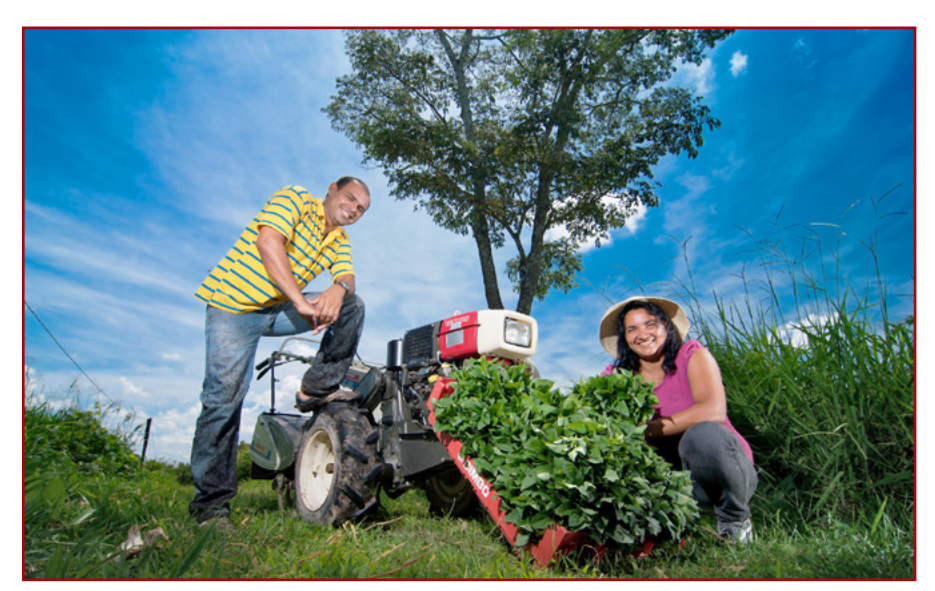
Farmers next to motocultivator granted by the Mais Alimentos programme, Acre, Brazil 2010.

Starting in 2003, the federal government embarked on a major effort to create and expand public policies for the strengthening of family farming and, simultaneously, for the settlement of thousands of landless families.