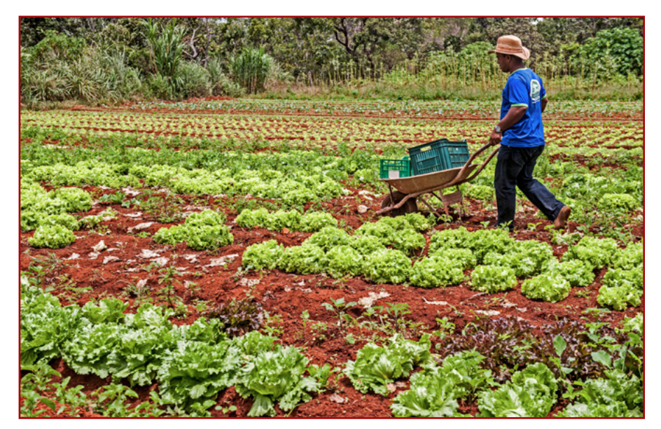
Family farmer in Planaltina, Distrito Federal, Brazil, 2014.