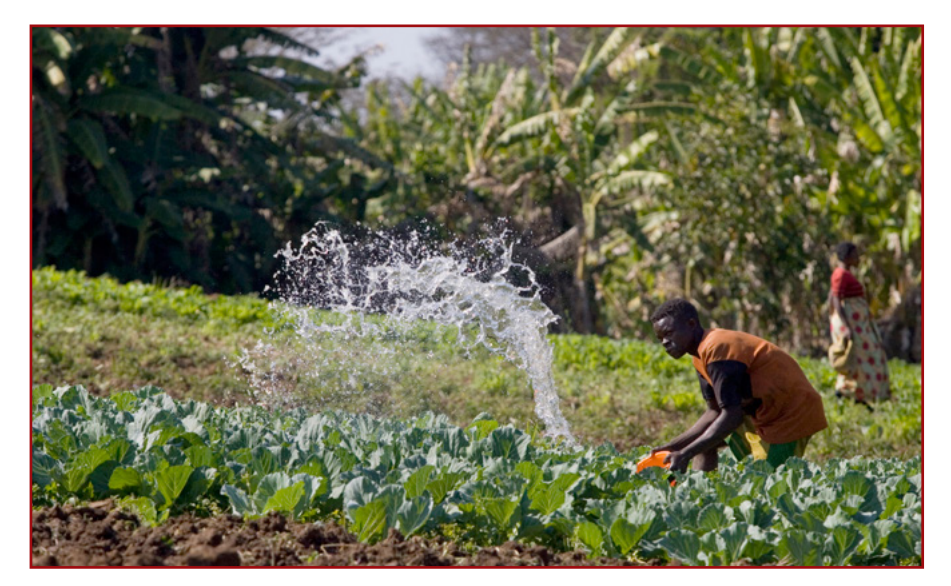
Beneficiary of the Programme for the Development of Urban and Peri-Urban Horticulture, Demogratic Republic of Congo, 2008.