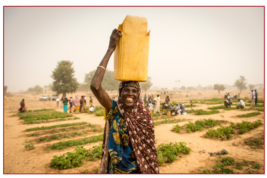
Niger beneficiary in community garden, Nigeria, 2014 <a href="https://goo.gl/uk4xos">https://goo.gl/uk4xos</a>.

A fifth category can be added to the above list: the social and solidarity economy actors that create spaces for collective action in favour of cooperative and solidary 'eco-citizens'.