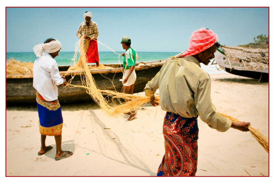
Fishermen in Kovalam, Kerala, South India, 2011 <a href="https://goo.gl/sZ7V7x">https://goo.gl/sZ7V7x</a>>.

considerable poverty and unemployment rates, the downfall of artisanal fisheries could lead to many families becoming destitute. It is unlikely that the mechanised sector would gainfully absorb the labour-intensive artisanal fisheries.