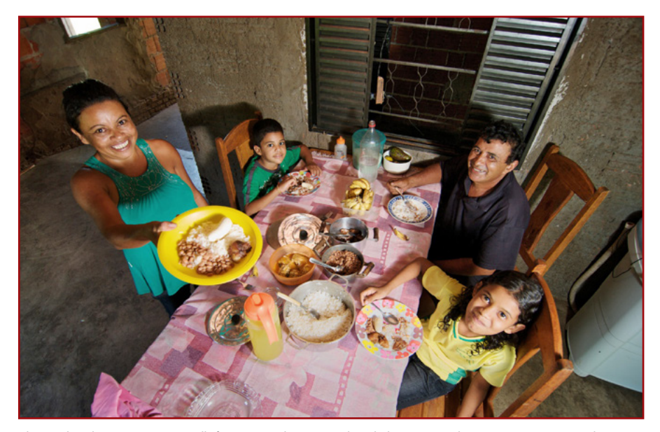
Familly farmers supplement meals with their own production, Mato Gosso, Brazil, 2010.

Family farming, instead of disappearing, has remained a key sector of agriculture and the economy of rural areas in countries of the Global South.