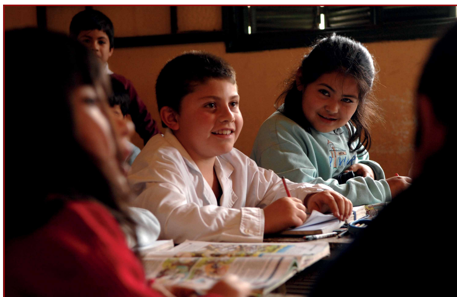
Young students in Argentina, 2007 < https://goo.gl/HYGNPT > < https://goo.gl/cefU8 >

Given these results—which we confirm through a conditional econometric analysis—the theoretical reasons to link the programme with labour formality outcomes, and the absence of sensible alternative explanations for divergent