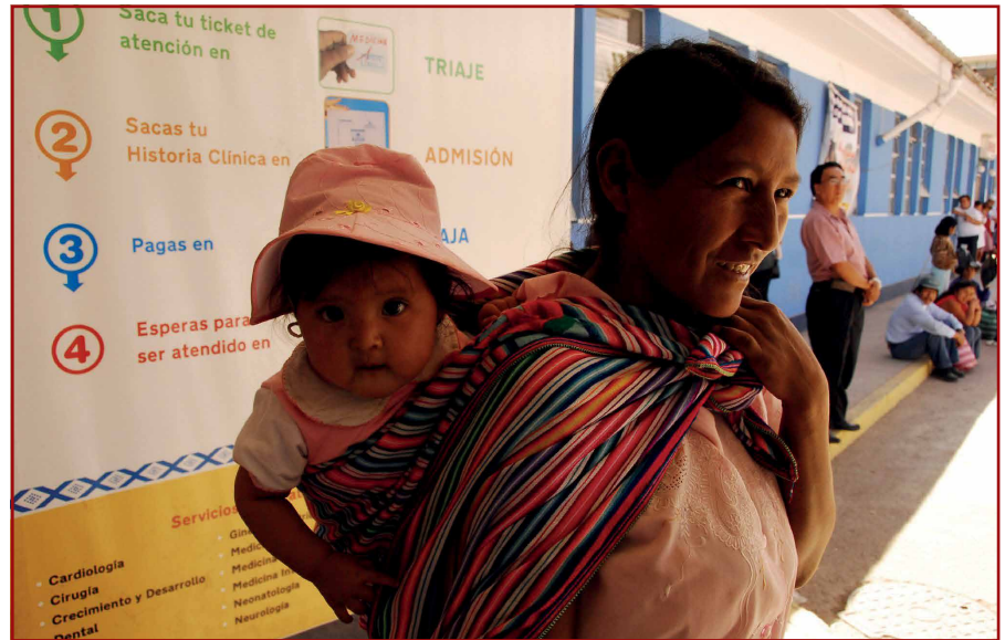
Photo: d.j. a., Hospital Regional de Ayacucho, 2007, Peru < https://goo.gl/AWAUK0 > < https://goo.gl/cefU8 >.

As previously mentioned, we attempted to revisit all treated and a sub-sample of control households (provided they were