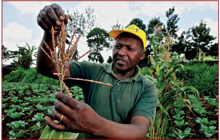
Maize crop, 2010, Kenya < https://goo.gl/6Qr4Ta > < https://goo.gl/OOaQfn >.

look at impacts of Argentina's Universal Child Allowance (AUH) on labour market outcomes. The AUH provides a monthly benefit per child to households whose members are not registered in the national social security system (either unemployed or working in the informal sector).