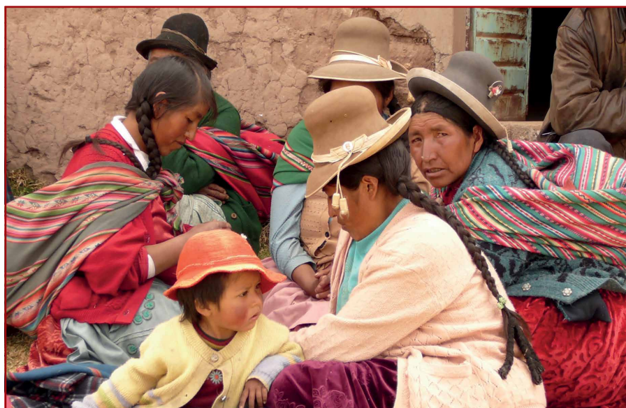
Photo: Ana Beatriz Urbano, 2009 IPC Photo Competition. Women in Lake Arapa, Peru.

beneficiaries also provides an opportunity to introduce relevant topics on health, nutrition, family planning and domestic violence during such training. It is expected that these activities will not only reinforce the programme's effectiveness but also improve the well-being of women beneficiaries by providing adequate tools to empower themselves and lift their households out of poverty.