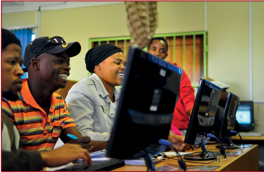
Photo: Beyond Access, Youth technology training, 2013, South Africa < https://goo.gl/1Eki3A > < https://goo.gl/OOQqfn >

the pension could raise the reservation wage and reduce the incentive to find work.