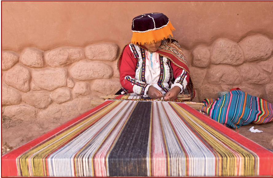
Photo: d.j. a., 2007, Ayacucho, Peru. < https://goo.gl/3lOzLk >< https://goo.gl/cefU8 >.

As a whole, the impact evaluation of the SPP shows that a face-to-face financial education programme without monetary incentives which targets the poorest families—mainly Quechua-speaking rural women in Peru receiving CCT benefits—can generate changes in its target population. We found positive impacts on income generation capabilities (i.e. investment in livestock), presumably derived from an increase in financial knowledge and savings. As such, this kind of programme is able to generate financial knowledge and promote savings even among the poorest populations. We also found impacts on empowerment at the community level and non-harmful effects on social networks, which suggest that these kinds of programmes do not have detrimental effects on social relationships.