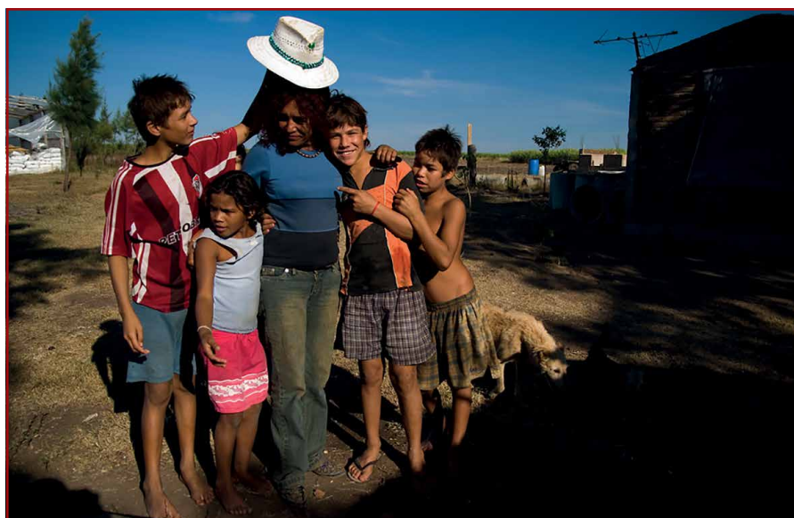
Photo: Montecruz Foto, Campo Placeres, 2009, Uruguay < https://goo.gl/fpRGhA > < https://goo.gl/OOAOQfn >.

Women tend to use the money in a way that improves the welfare of the household—and particularly of children—as a whole.