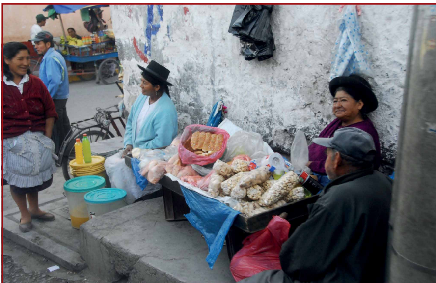
Photo: d.j. a., 2007, Ayacucho, Peru. < https://goo.gl/3lOzLk >< https://goo.gl/cefU8 >.