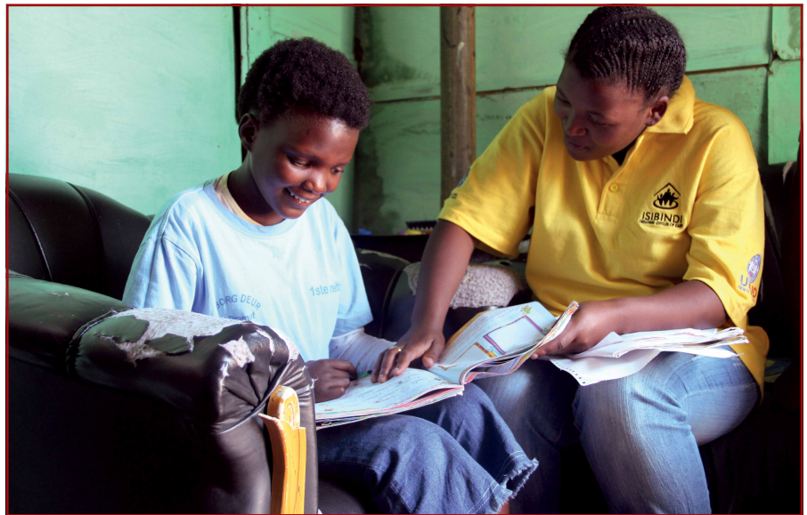
Working within the community, 2013, South Africa < https://goo.gl/ZisyRq > < https://goo.gl/sZ7V7x >.

The old-age pension does not appear to have unintended—or adverse—effects on the choices of these rural young men in the labour market.