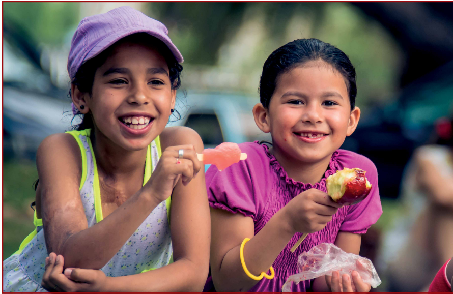
Photo: Gonzalo Useta, Sonrisas marcadas , 2013, Uruguay < https://goo.gl/vZoDWs > < https://goo.gl/cefU8 >.