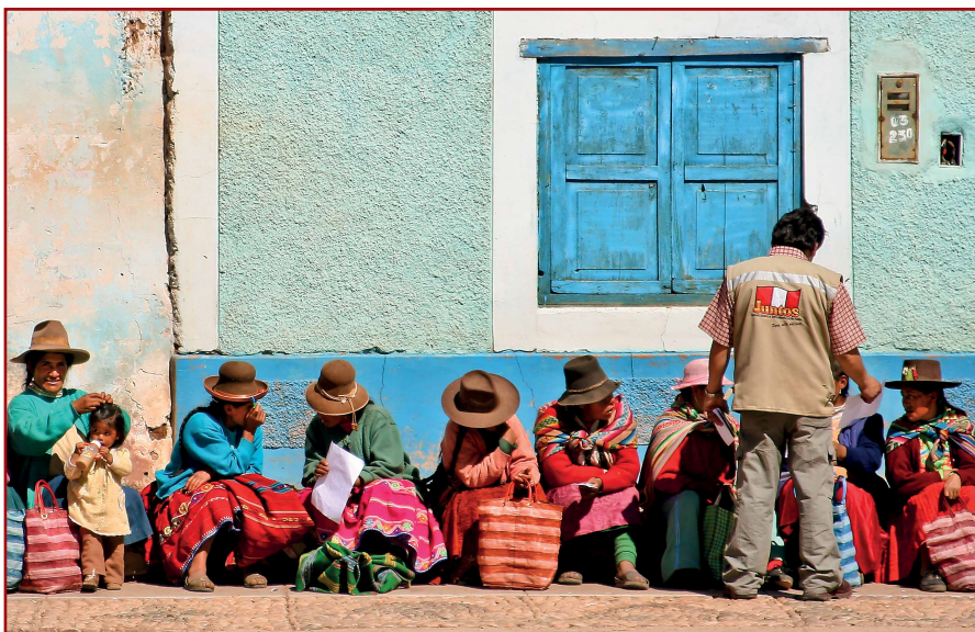
Photo: Douglas Klostermann, 2009 IPC Photo Competition. Indigenous women in Combapata plaza, Peru.

It is important not to lose sight of the main objectives of social grant programmes, namely: smoothing consumption patterns and preventing poor and vulnerable households from adopting harmful strategies to cope with socio-economic shocks. However, the evidence shown throughout the articles of this issue demonstrates that social protection can also have a positive role in labour market activation. The hypothesis of dependency