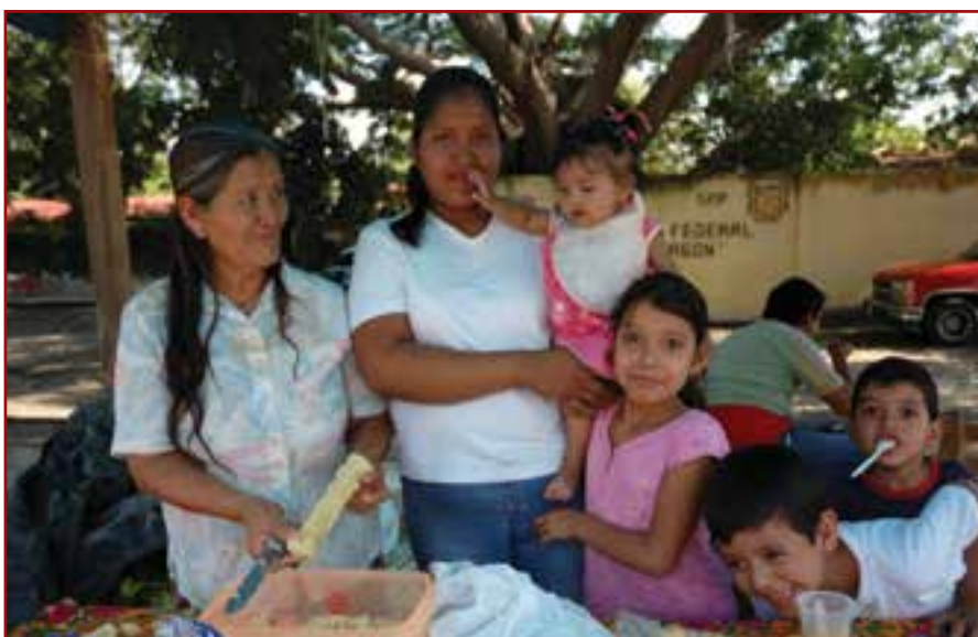
Family selling maize snacks at roadside stall, 2006, Mexico < http://goo.gl/zHSdeh > < http://goo.gl/rek3eJ >.

If related households share the conditional cash transfer among each other, then this