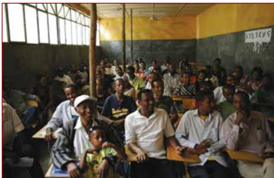
Ethiopia.