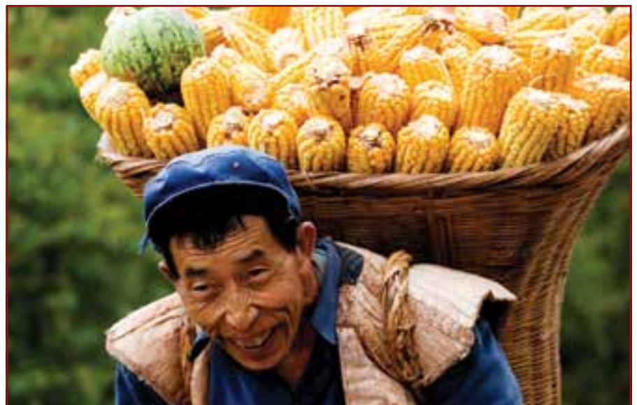
Farmer carrying corn to local market. Hong Kong, China.

We clearly don't live in a world of perfect markets, and the various ways in which markets underperform can generate positive productivity effects of anti-poverty programmes.