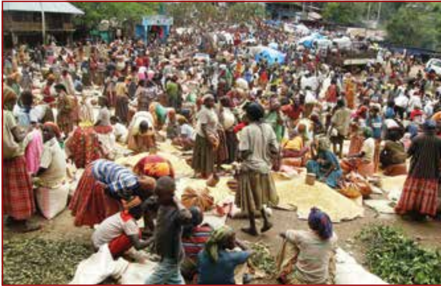
Photo: Achilli Family. Konso Market, Ethiopia, 2007. < http://goo.gl/csQ5XH > < http://goo.gl/lclUqb >.