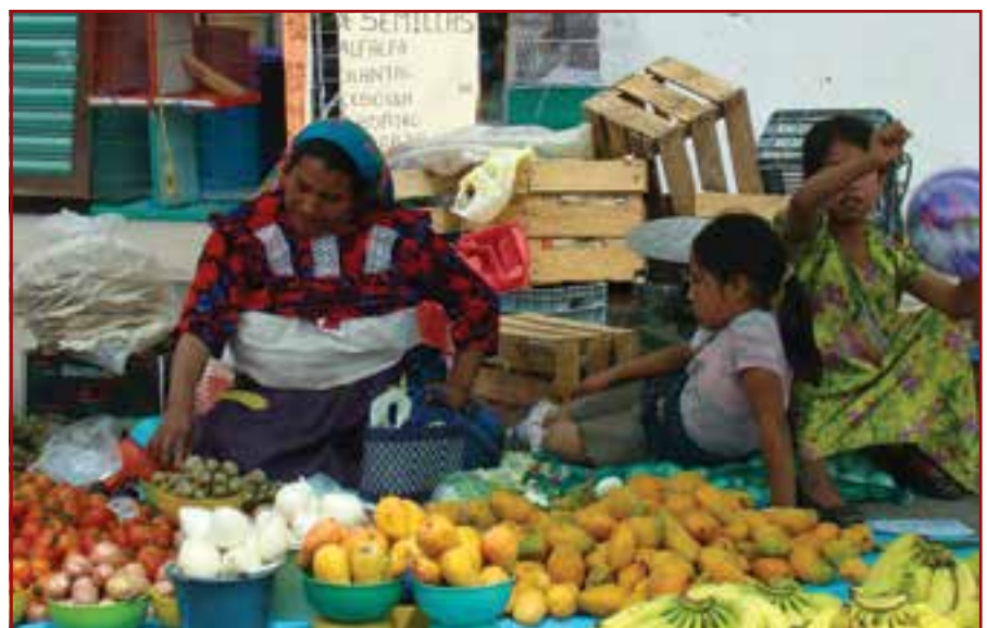
Photo: Maria Luiz Aquilante, 2009 IPC Photo Competition. Market in Tlacolula, Mexico.

Changes in local prices are neither universally good nor bad for households, because poor people in developing countries are often involved in the production as well as the consumption of food.