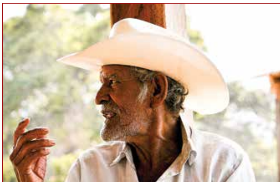
Photo: Eduardo Robles Pacheco, En el ejido Cuauhtémoc (36), 2013, Mexico < http://goo.gl/tVPP3B > < http://goo.gl/rek3eJ >.

The ejido sector has the peculiarity of combining poverty with asset endowments that were badly underused due to extensive market failures. Incomplete property rights prevented