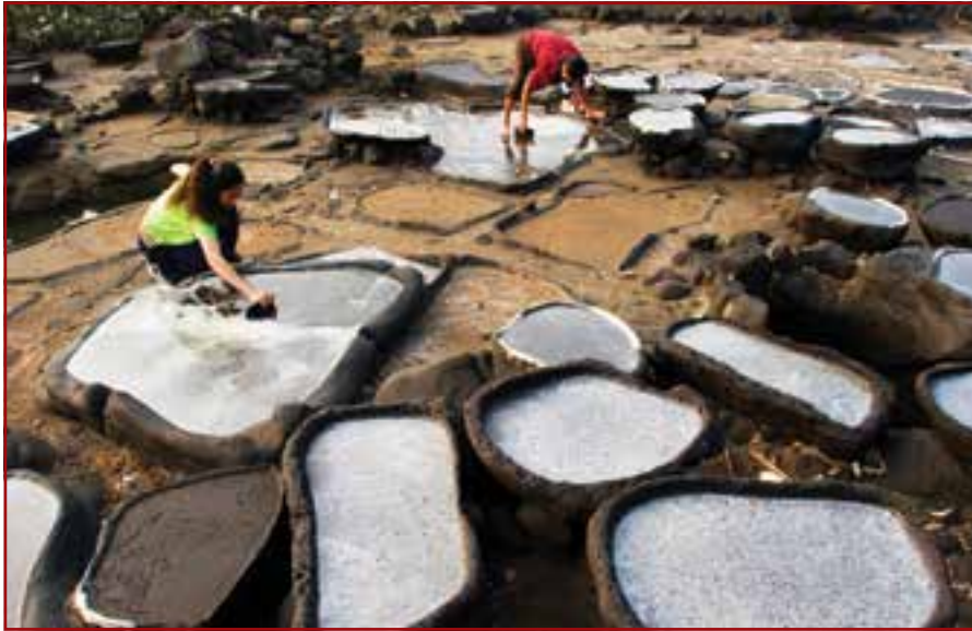
Salt farming on volcanic rocks. Hong Kong, China.

“ In the long term, the effects on growth will be positive only if permanently higher productivity growth is achieved in the local economy.