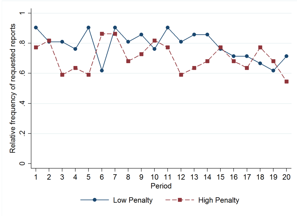
Figure 2: Relative frequency of requested reports