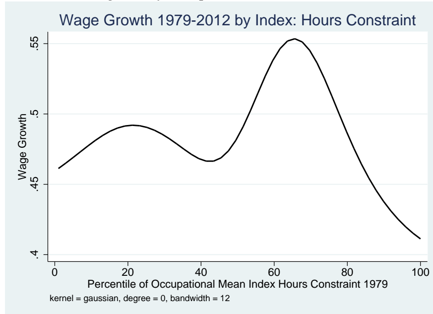
Figure 4: Average wage growth in occupations in 1979-2012 sorted by the average index in hours constraint in 1979, weighted by occupational shares in 1979