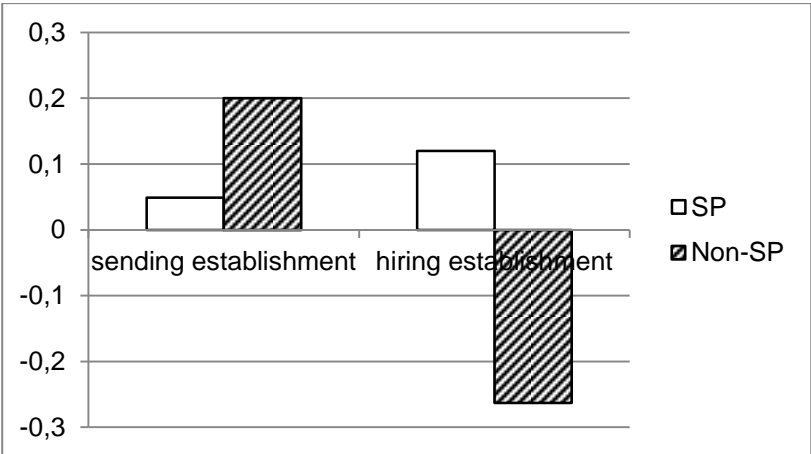
Figure 2 : Mean wage position, SPs and Non-SPs