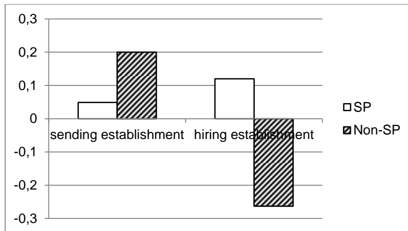
Figure 2 : Mean wage position, SPs and Non-SPs

Data Source: Integrated Employment Biographies, Establishment History Panel, IAB Establishment Panel and Employment Statics; own calculations.