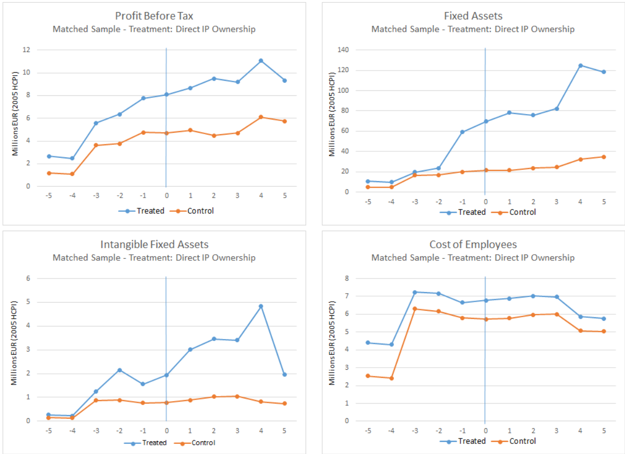
Figure 3: Comparison of Matched Groups (in real 2005 EUR)