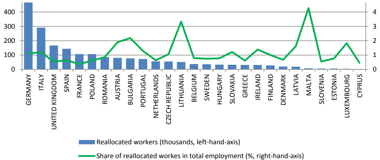
Figure 2: Aggregate reallocation in absolute number of persons and as a % of total employment