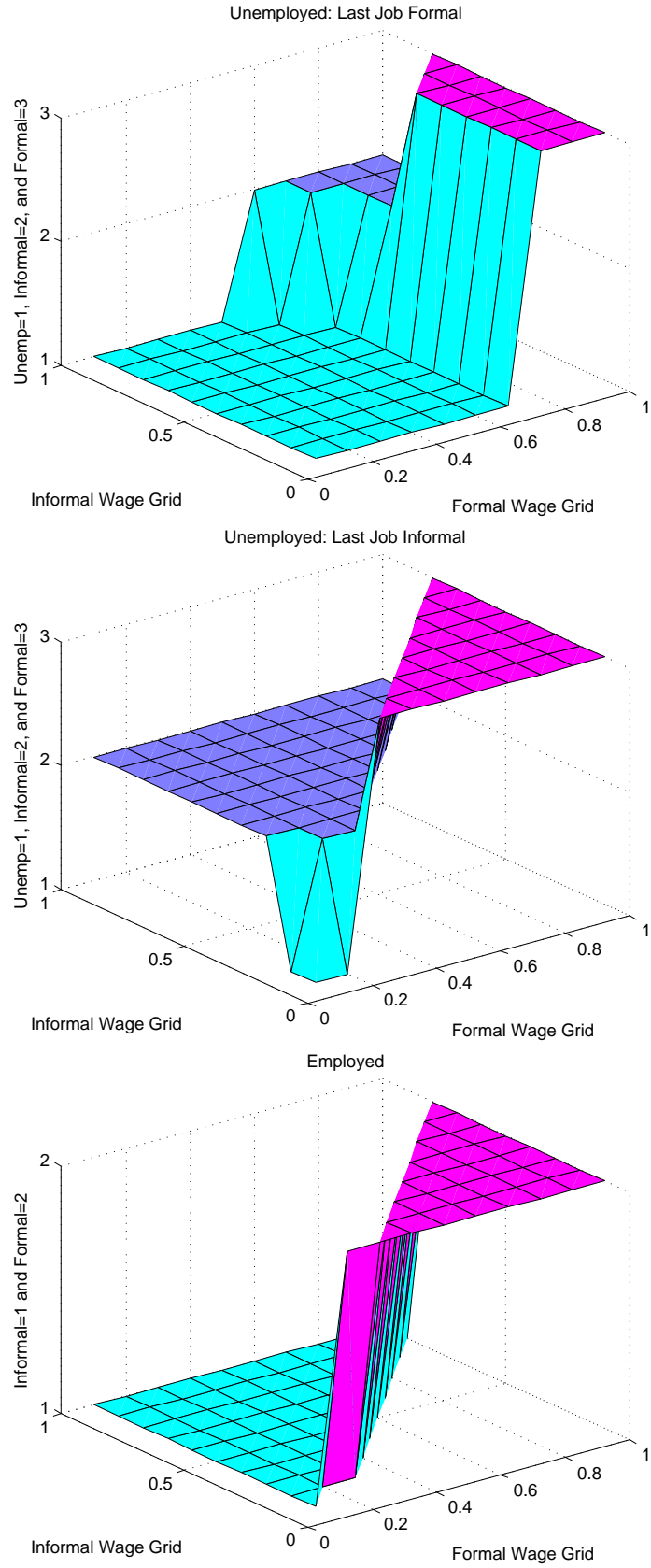
Figure 2: \tau = 0.35 and \rho = 0.30 under high-intensity scenario.