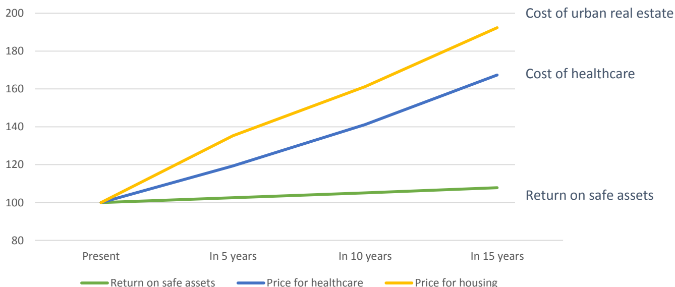
Figure 3. The long-term gap on savings

Note: Illustration of the ‘catching-up problem’ for long-term savings, where the return on safe assets cannot catch-up with rising costs of urban real estate or healthcare. For illustrative purpose, the return on safe assets is assumed at 0.5% p.a., the annual price increase for healthcare at 3.5% and the annual price increase for real estate in urban areas at 4.5%. €100 invested in safe assets will cumulate after 15 years to €108, while the cost of healthcare will have risen from €100 to €168 and of housing to €194.