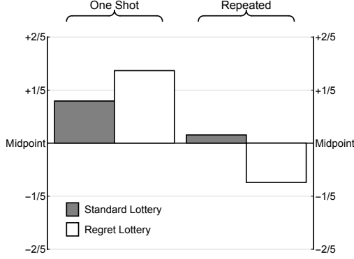
FIGURE A1. Average valuations relative to midpoint