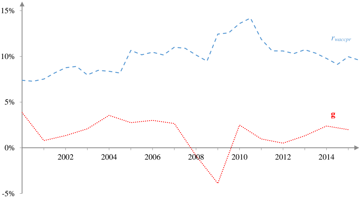
Figure 1: OECD-Sample Capital Productivity and Growth.

Figure 1 shows the capital productivity and growth rate of all countries considered in the analysis. On average, capital productivity is 9.9% while the growth rate is 1.5%. This indicates dynamic efficiency. The PGD, which can be interpreted as an indicator for budget tightness, is positive at all times and increases sharply in 2008. This is driven by the decreasing growth rate during the Great Recession. It stays above pre-crisis levels even after the growth rate recovers due to an increase in capital productivity. The latter peaks at the end of 2010 at 14.2% and stays between 9-11% for the remainder of the time series. The PGD is somewhat higher during this time compared to the first half of the timeframe under consideration. This increase illustrates the tightening resource constraint faced by firms as a result of the crash in 2008/2009. A downward trend in capital productivity is not visible. Indeed, productivity seems to rise slightly: the average of the period from 2000-2007 is about 2% below the average between 2007 and 2015.