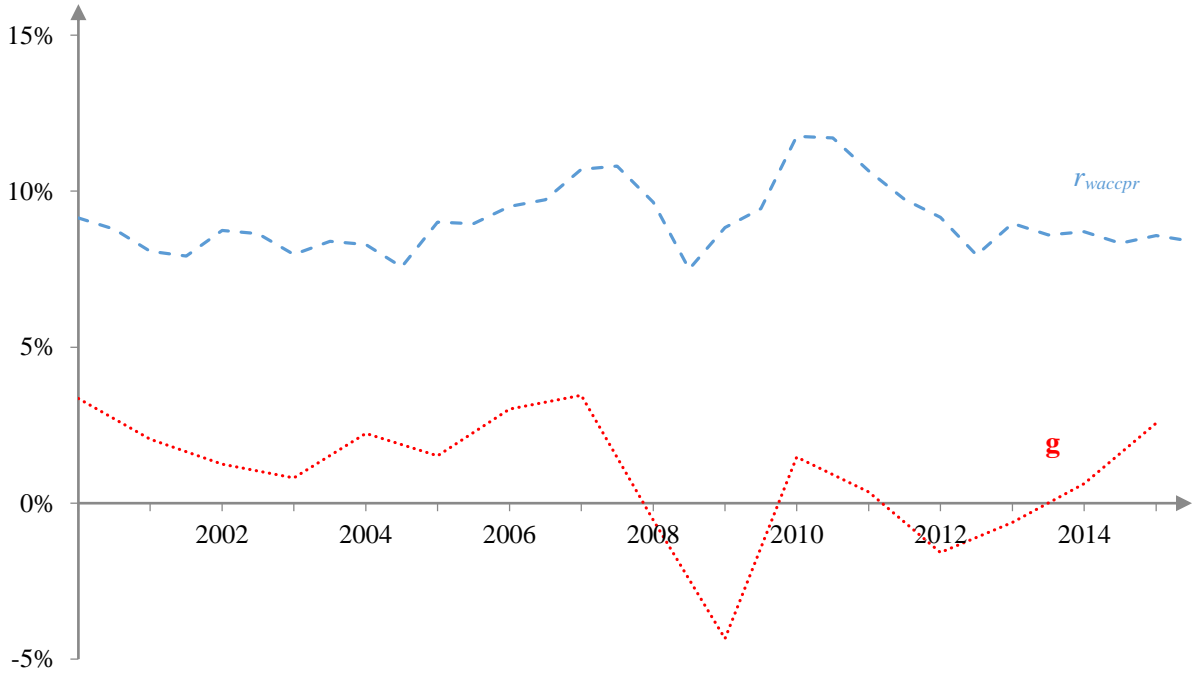
Figure 2: Eurozone Capital Productivity and Growth.

Compared to Figure 1, the difference of the PGD before and after the crisis is more pronounced. From 2000-2007, the PGD is between 5.8-7.5%. In the following years it is slightly above 10% with a maximum of 13.2% in 2009. During the last two years under consideration it falls below 10% due to the recovering growth rate, reaching pre-crisis levels in 2015 at 6%. There seems to be no upward or downward trend concerning capital productivity.