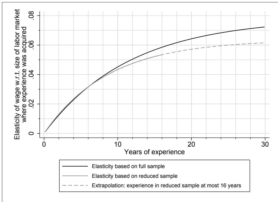
Figure 2: Magnitude of dynamic agglomeration benefits

of working in large labor markets accumulate over time. This is shown by figure 2. Based on the regression results reported in columns (3) and (4) of table 6, it illustrates for different levels of experience the elasticity of wage with respect to the size of the labor market in which previous experience was acquired. Consider for example a worker with two years of work experience at date t . The corresponding elasticity is given by about 0.01. In other words, doubling the size of all labor markets in which the two years of experience were acquired results in a 0.7 percent higher wage at date t . In contrast, after ten years of work experience the elasticity amounts to about 0.045, meaning that doubling the size of all labor markets in which ten years of experience were acquired results in a productivity increase at date t by about three percent. At a very high level of experience the elasticity is even larger. 26 That the elasticity significantly increases in the amount of experience points out that dynamic agglomeration economies play an important role. The marginal increase in the elasticity with respect to experience is smaller the higher the level of acquired experience since marginal returns to experience are decreasing (see equation (7)).