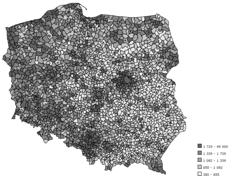
Figure 2. Own revenues per capita of Polish municipalities in 2013 (in PLN)