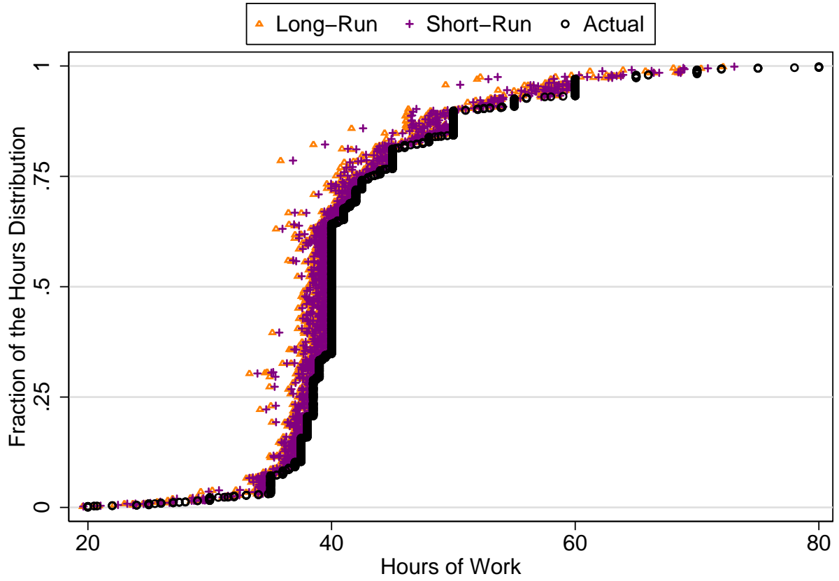
Figure 3: Reduction in Hours of Work

Notes: Small circles indicate the percentile rank of individual i in the actual observed distribution of hours of work (vertical axis) and the actual hours of work (horizontal axis) in 2011. Triangles maintain the percentile ranking from the observed distribution and indicate the simulated short-run value of the hours of work when \sigma_{w,it} is set to \sigma_{w,it}^{\min} . Plus symbols denote the respective long-run hours of work when \sigma_{w,it} is set to \sigma_{w,it}^{\min} .