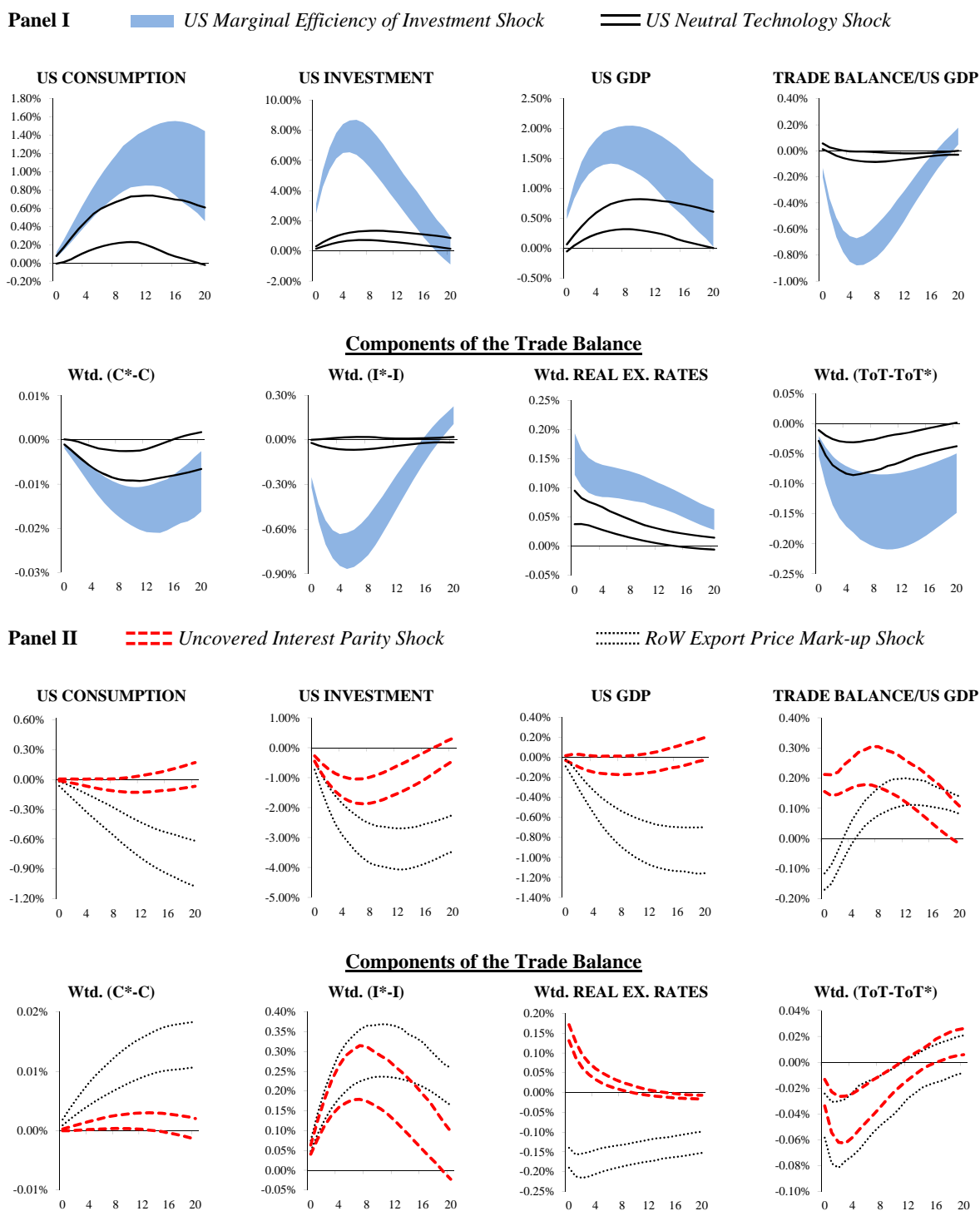
Figure 2: Estimated Impulse Response Functions of Selected Variables

Note: We present the 5th and 95th percentiles of IRFs computed from 150 random draws from the posterior distribution. The aggregate trade balance impulse response is the sum of the impulse responses of the components. The abbreviation 'Wtd.' indicates that the concerned variable has been multiplied by the coefficient in Equation 15 in the main text. Importantly, the coefficient on the relative terms of trade is negative because the estimate of the trade-elasticity is below unity.