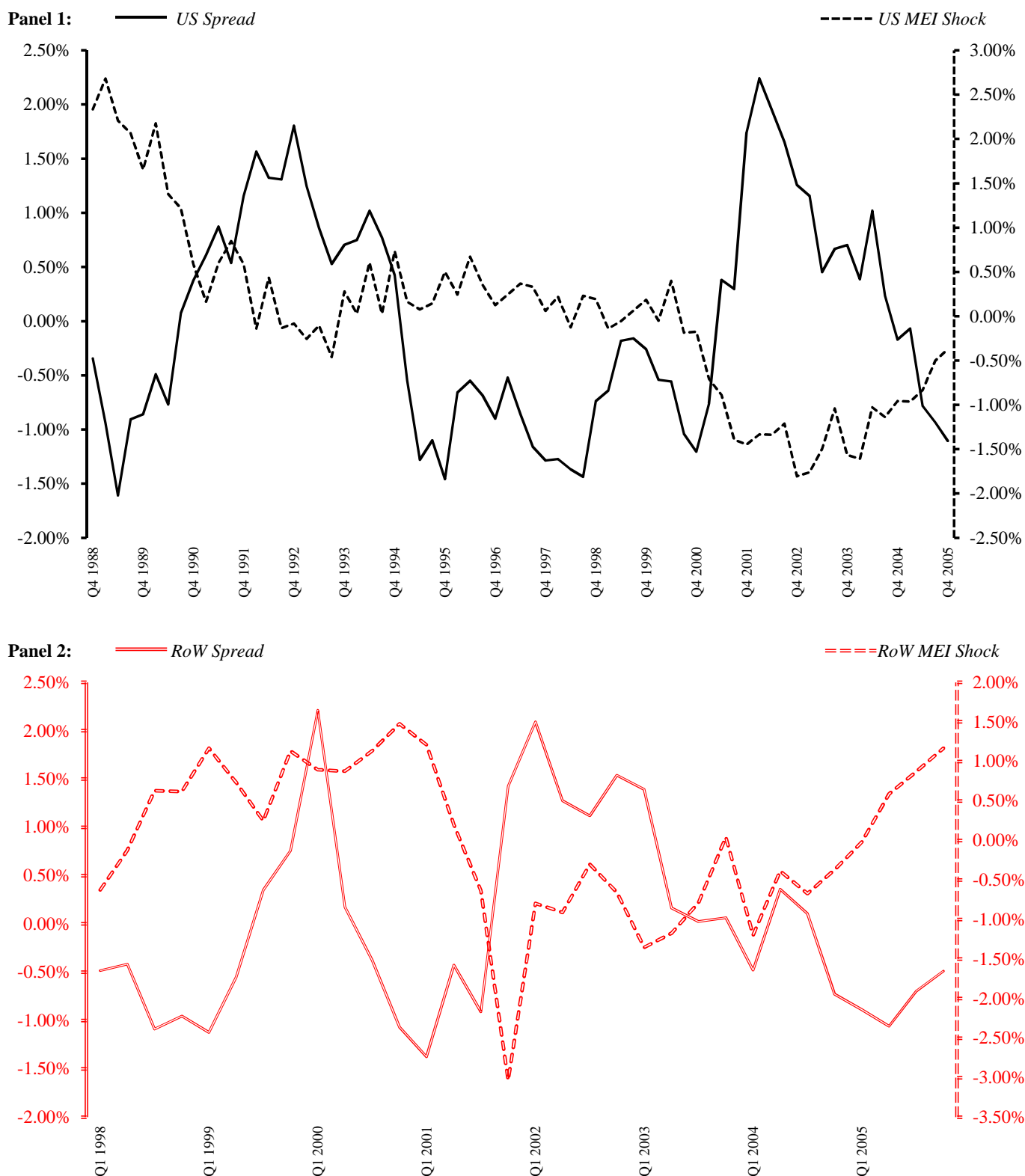
Figure 3: The MEI Shock and the External Finance Premium

Note: The MEI shocks are distilled by applying the Kalman smoother when the parameters are set at the posterior mode. The external finance premium is proxied by the excess of BBB bond yields over the treasury bill rates or government bond yields. All series presented in the figure are standardized.