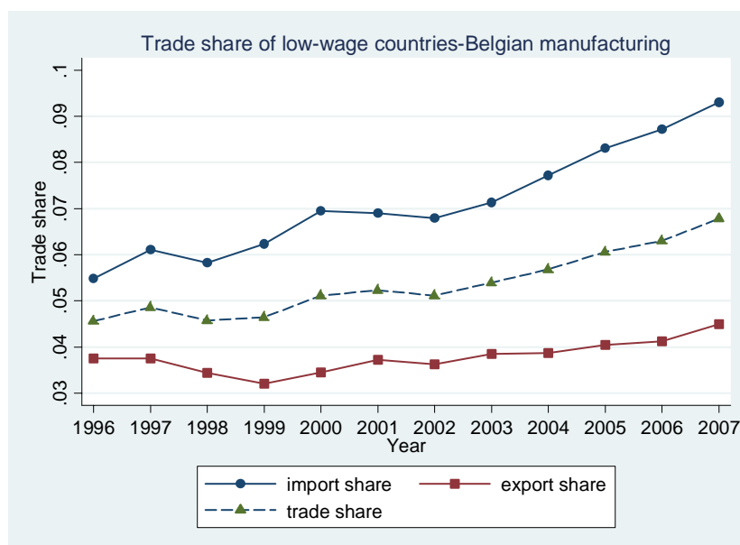
Figure 1: Trade share of low-wage countries in Belgian manufacturing.

As shown in Figure 1, the trade share of low-wage countries in Belgian manufacturing was growing during the sample period, but especially after 2002, which may be due to the effect of China's entering the World Trade Organisation (WTO) in 2001. The share of imports from low-wage countries was growing faster than export share of low-wage countries. The evolution of the low-wage trade share by 2-digit sector is reported in Table A2 in the Appendix.