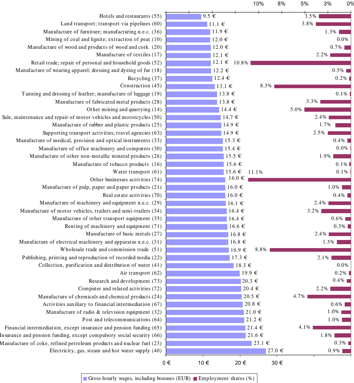
Figure 1: Gross Hourly Wages (Including Bonuses) and Employment Shares for Nace Two-Digit Industries, 2002

(652 in 2002 vs. 502 in 1995) and that the majority of the workforce is employed in Flanders (62 per cent in 2002). Finally, let us notice that the proportion of workers whose wages are collectively renegotiated at the company level has been decreasing from approximately 39 to 20 per cent between 1995 and 2002. The majority of workers have their wages thus solely determined through national and/or sectoral collective agreements.