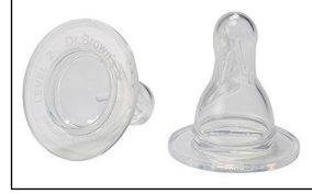
(a) A nipple product that is complimentary with the feeding bottle product in the right side

It can be seen from the results that our proposed MPUM