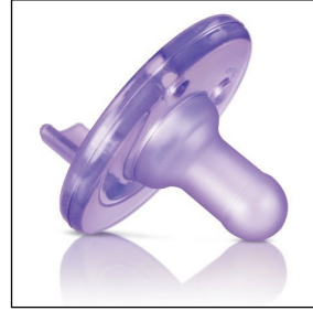
(b) Another nipple product that is substitutional with other nipple products