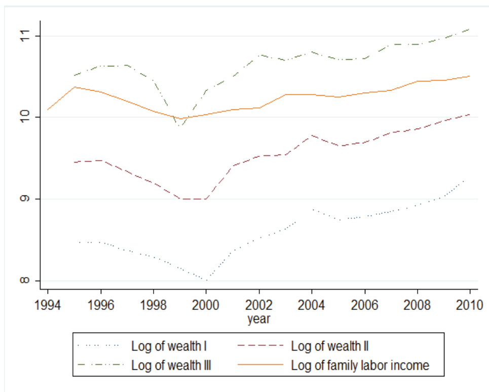
Figure 2: Yearly means of wealth and income