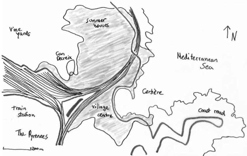
Figure 1: Overview Can Decreix and surroundings (author's creation)

In this section I describe Can Decreix, the place which led to the analysed experiences. For this I locate and describe Can Decreix in space and time, taking a place as never the same and constantly changing, influenced by people and ongoing activities.