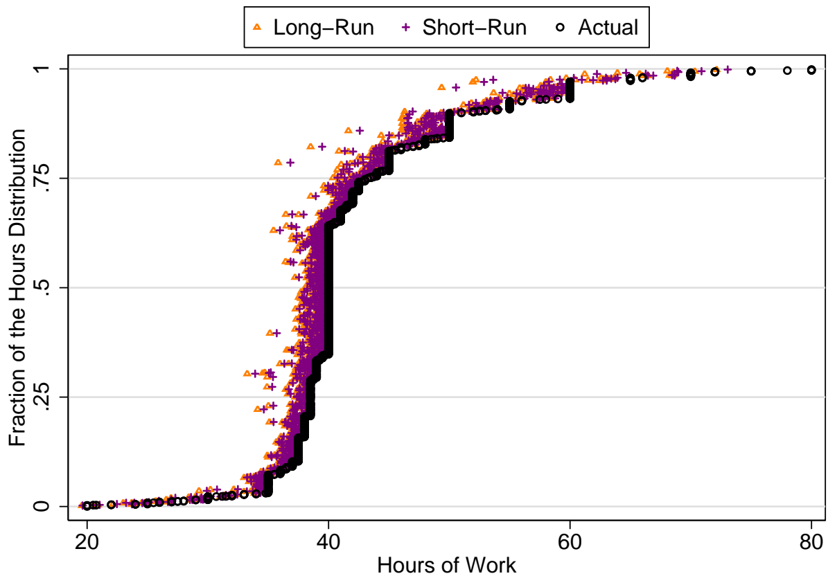
Figure 3: Reduction in Hours of Work

Notes: Small circles indicate the percentile rank of individual i in the actual observed distribution of hours of work (vertical axis) and the actual hours of work (horizontal axis) in 2011. Triangles maintain the percentile ranking from the observed distribution and indicate the simulated short-run value of the hours of work when \sigma_{w,it} is set to \sigma_{w,it}^{\min} . Plus symbols denote the respective long-run hours of work when \sigma_{w,it} is set to \sigma_{w,it}^{\min} .