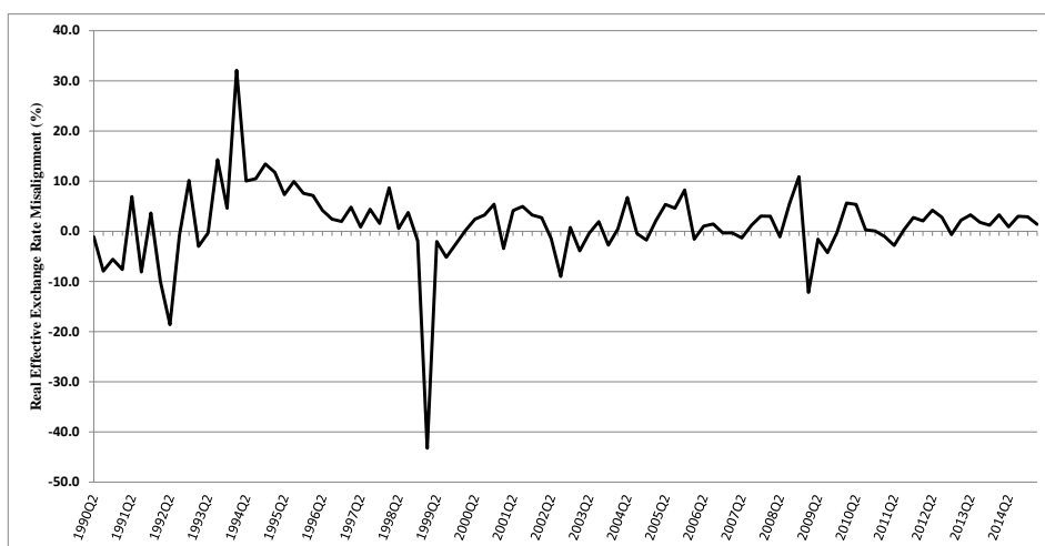
Fig. 2: Real Effective Exchange Rate Misalignment, 1990Q2 - 2014Q4

The period 2011Q1 – 2014Q4 recorded a higher degree of misalignment as the REER was overvalued by about 1.63 per cent, higher than an overvaluation of 0.72 per cent in the period 2006Q1 - 2010Q4 (Fig. 2).