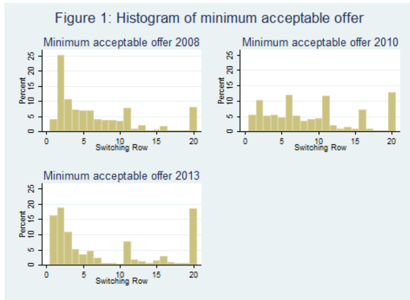
Figure 1: This figure reports the distribution of the experimental measure of risk aversion in 2008, 2010, and 2013 using a certainty equivalent task. In a nutshell, respondents make 20 decisions between a safe payoff and a lottery, where the lottery remains unchanged but the safe payoff increases steadily row by row. Further details on the experimental procedure are displayed in Appendix A.