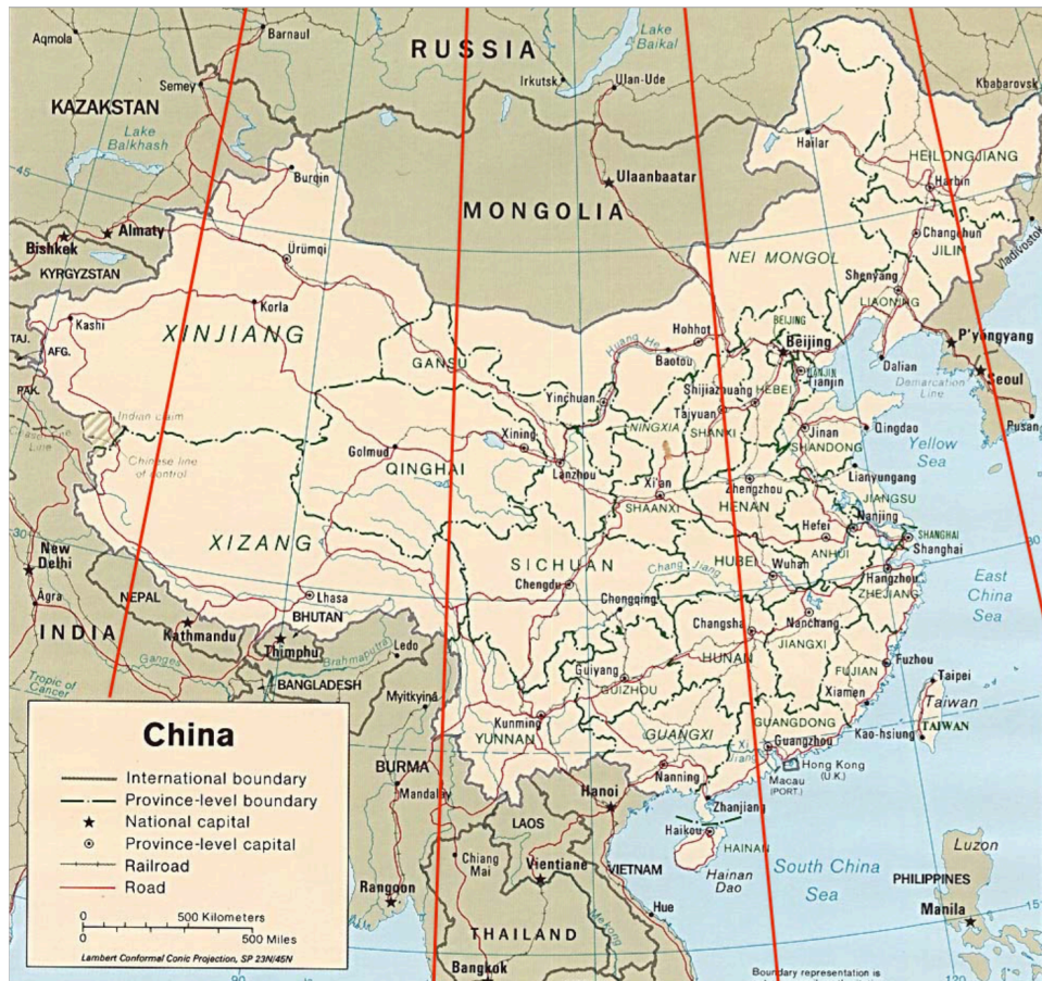
Figure 2: China time zones according to the Coordinated Universal Time (UTC)

Notes - This map was downloaded from http://www.lib.utexas.edu/maps/middle-east_and_asia/china_pol96.jpg . The red vertical lines (elaborated by the authors) correspond to the UTC time zone areas.