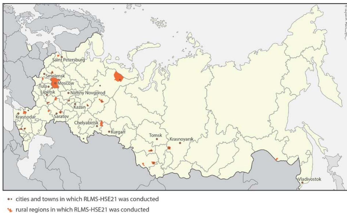
Appendix 1. Locations where the RLMS-HSE 2012 was conducted