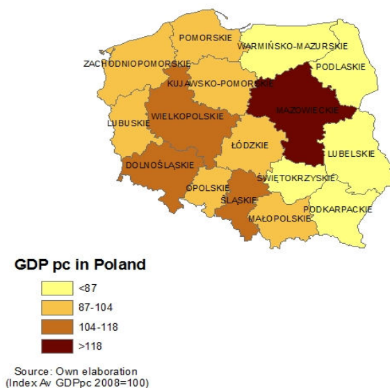
Map 1: GDP per capita across Polish Regions in 2008

Moreover, these disparities show a well-defined “core-periphery” type of structure in the sense that we can see a clear spatial income gradient for the Polish GDP pc. Map 1 plots GDP pc across Polish NUTS 2 regions relative to the country’s 2008 average. From the map it is clear the Western-Eastern division of the country in terms of income being the Western part performing as the core economic areas and the Eastern as the periphery economic areas in a New Economic Geography sense. This pattern can also be seen in figure 1 which plots GDP per capita against distance to Wroslaw, more or less the geographical centre in terms of income. The results show that as we move further away from Wroslaw, GDP per capita (on average) decreases.