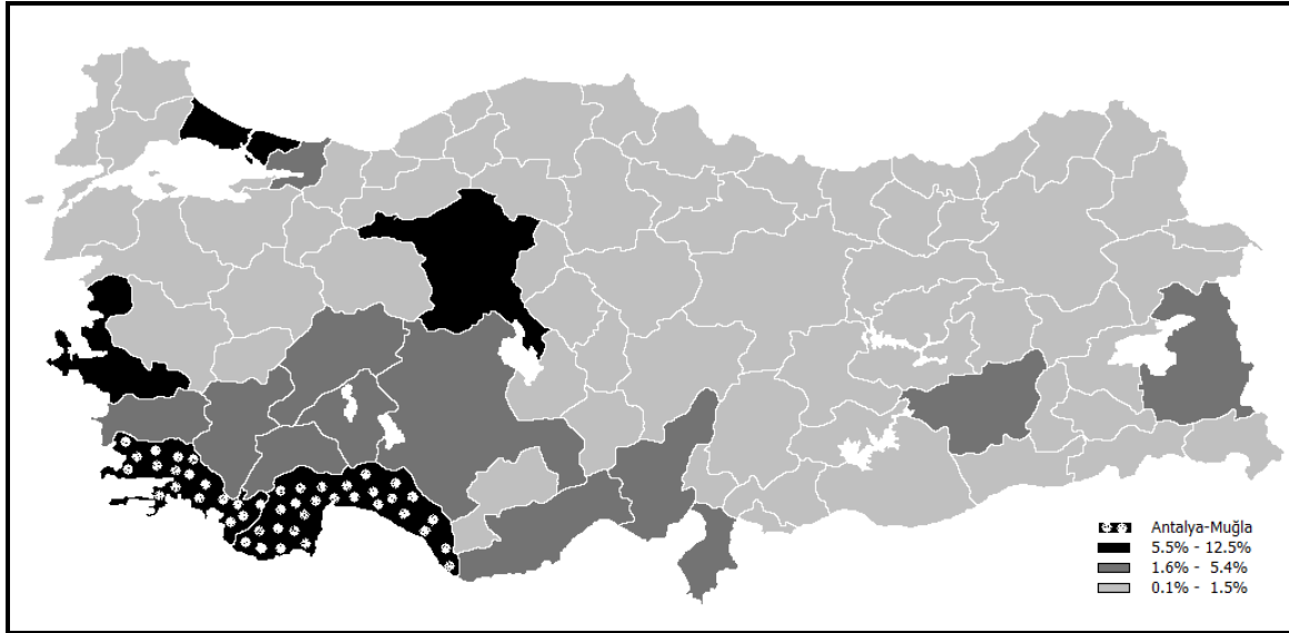
Figure 2: Origins of Immigrants in Antalya+Muğla (1995-2000)