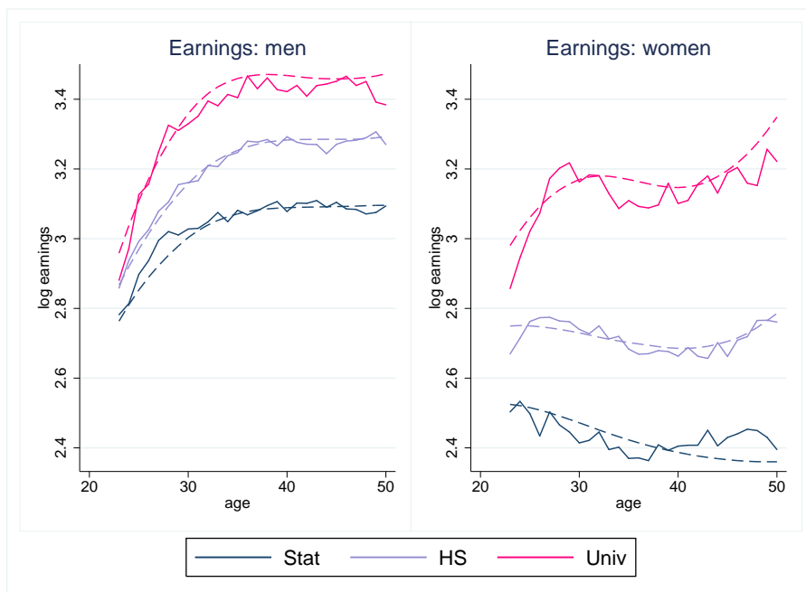
Figure 2: BHPS data and model predictions: log annual earnings for men and women over the lifecycle

Notes: Full lines are for BHPS data and the dashed lines are for model simulations. Annual earnings in real terms (£1,000, 2008 prices).