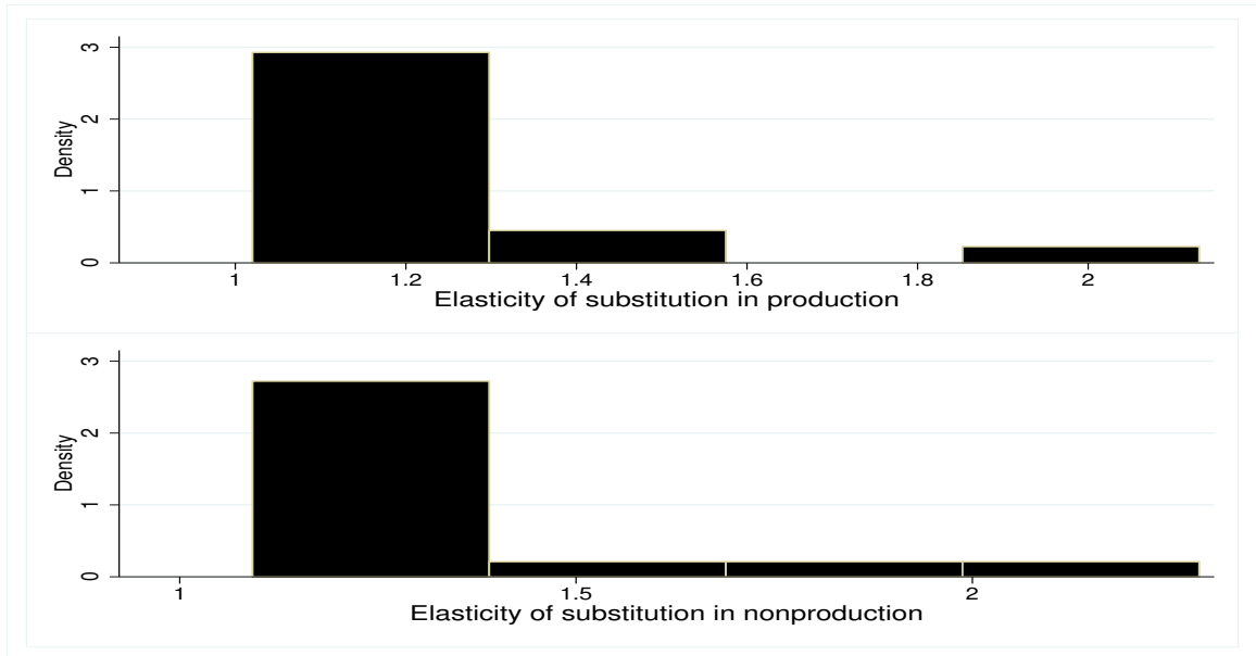
Figure 2: Histograms of the elasticities of substitution between skilled and unskilled labor.