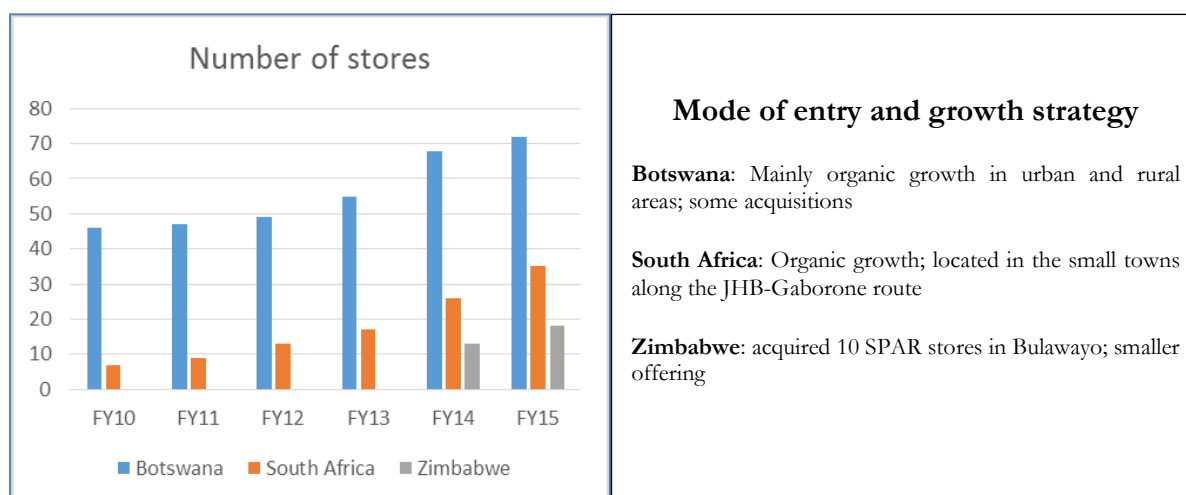
Figure 1: Growth of Choppies store numbers and mode of entry