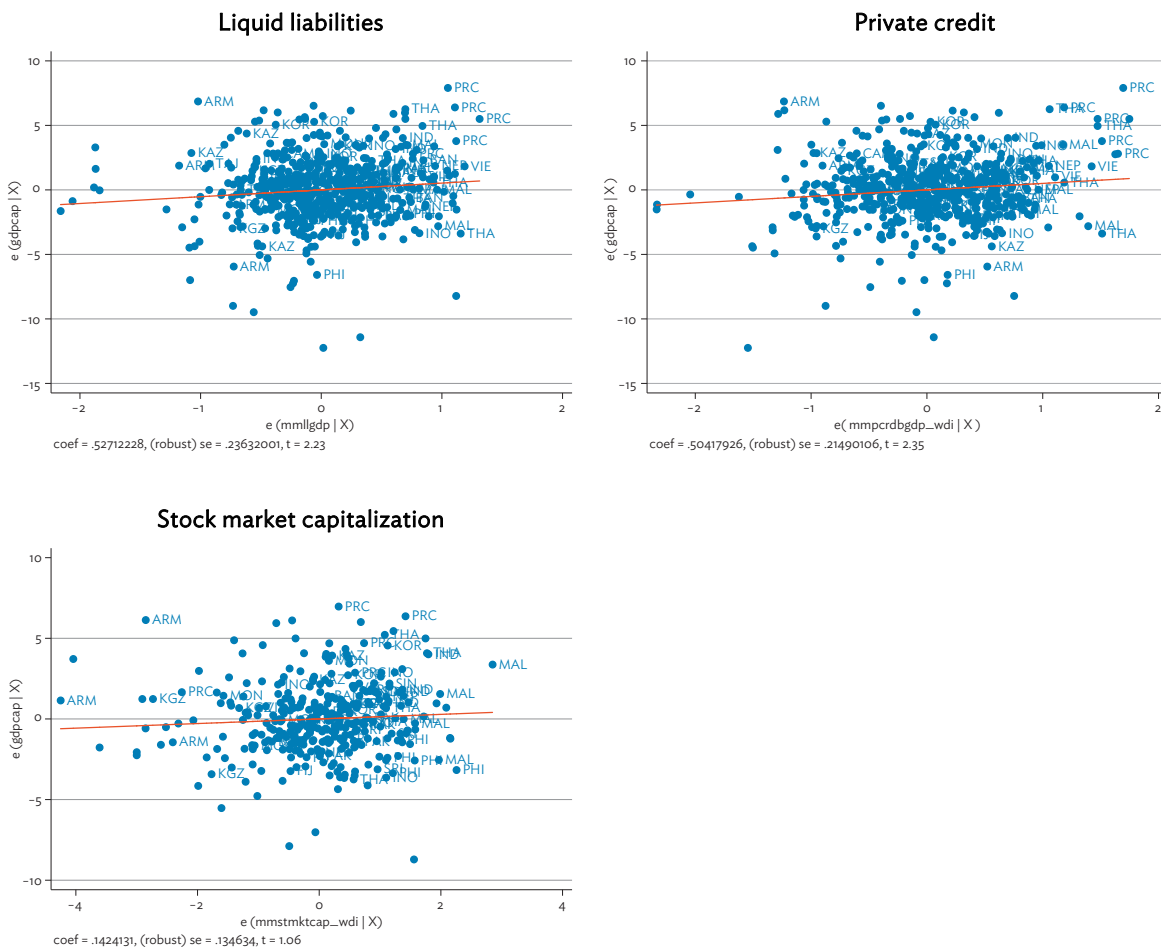
Figure 5: GDP per Capita Growth and Financial Development Measures, with Total Capital Flows as Openness Indicator and under a de Facto Foreign Exchange Regime