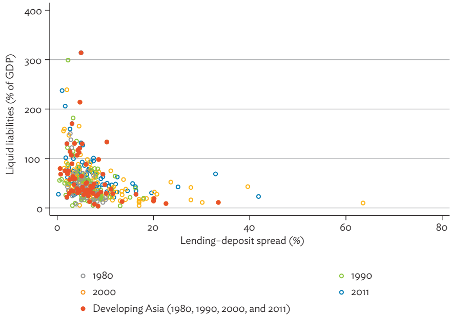
Figure 1: Liquid Liabilities and Lending-Deposit Spread