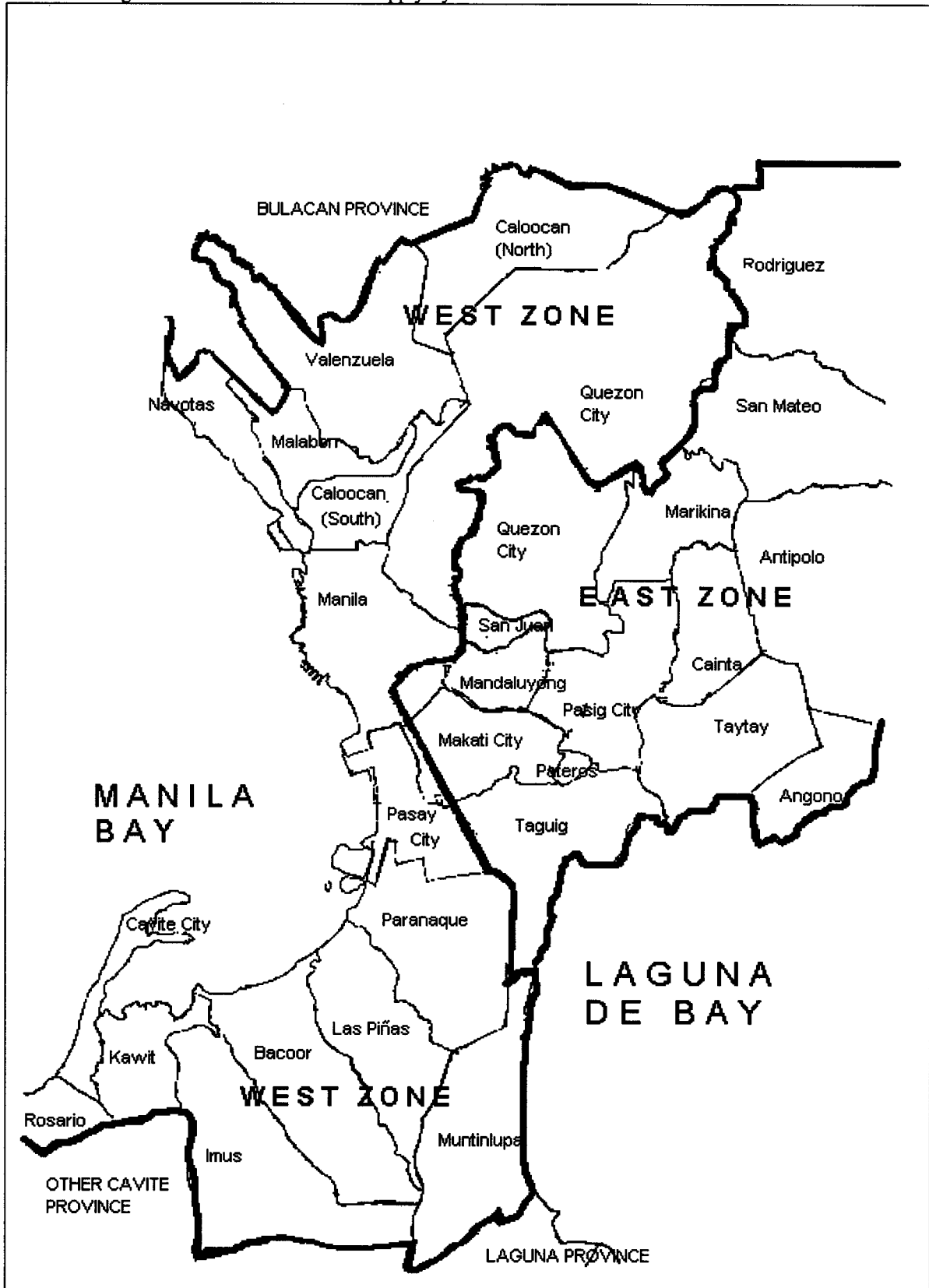
Figure 1. Metro Manila Water Supply System Concession Service Area