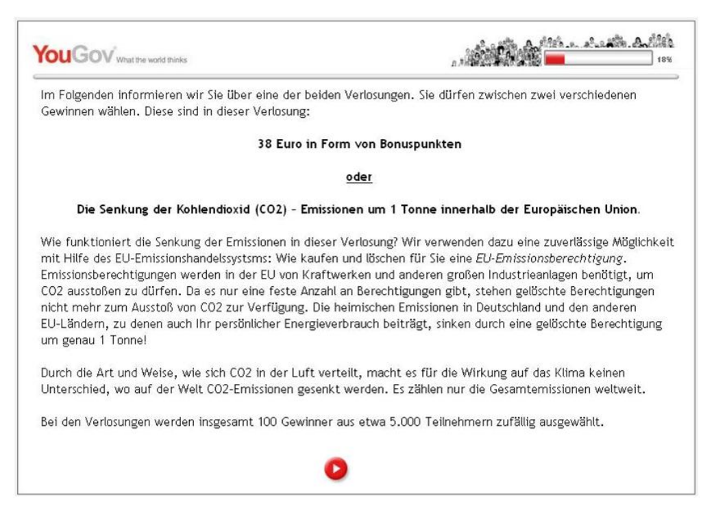
Figure 6: Information screen of the EUA treatment