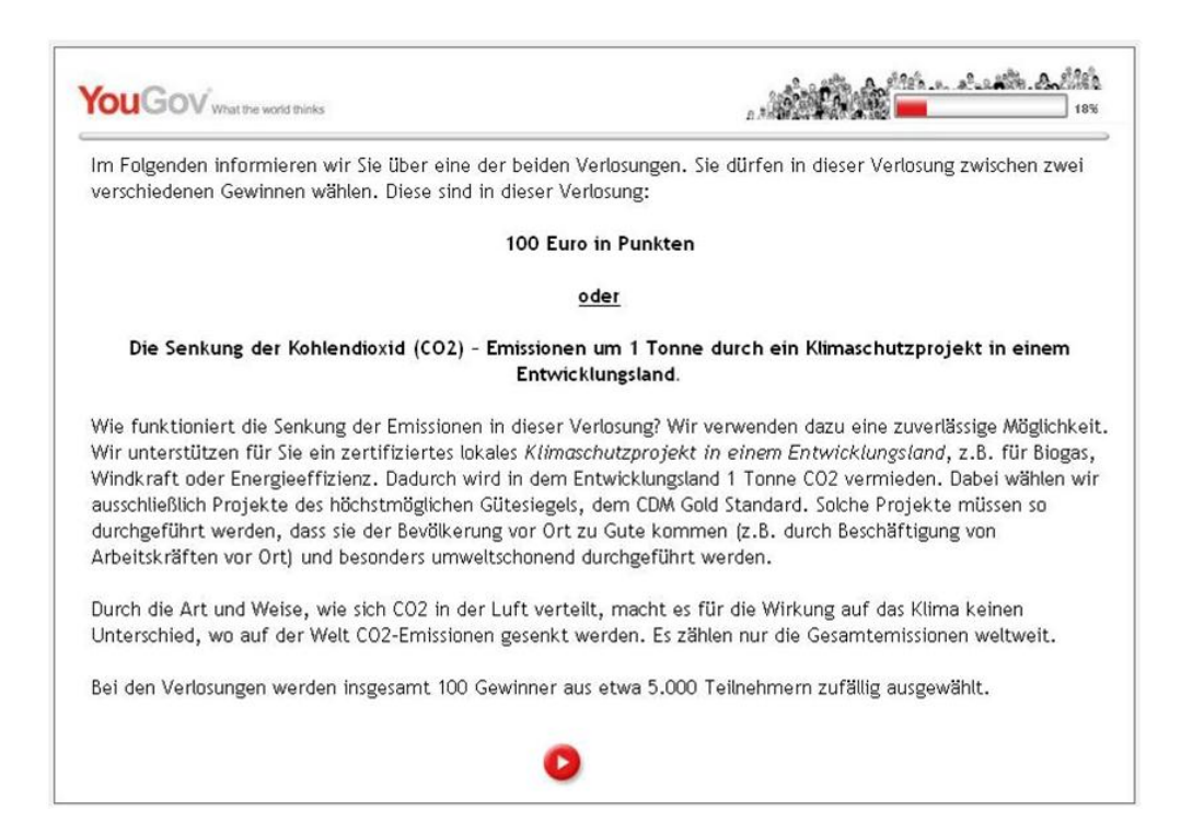
Figure 8: Information screen of the CER treatment