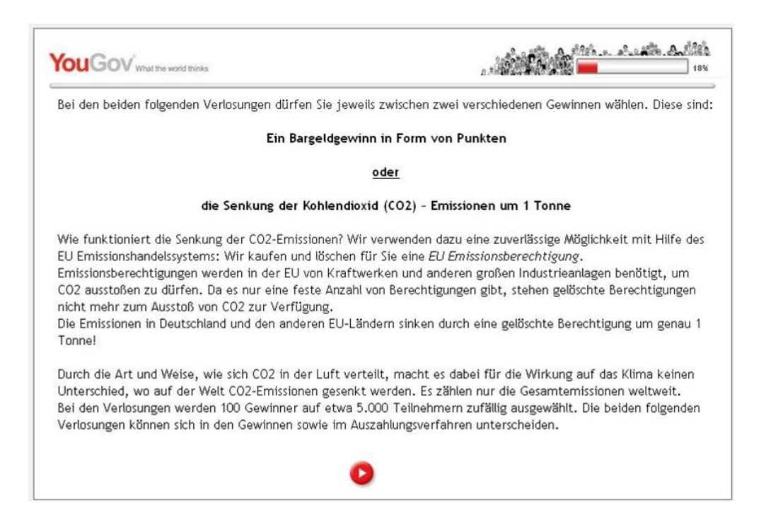
Figure 1: Information screen of the Baseline, Warm Glow, Image, and WGI treatments