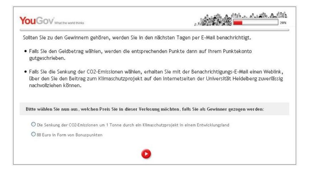
Figure 9: Decision screen, CER treatment