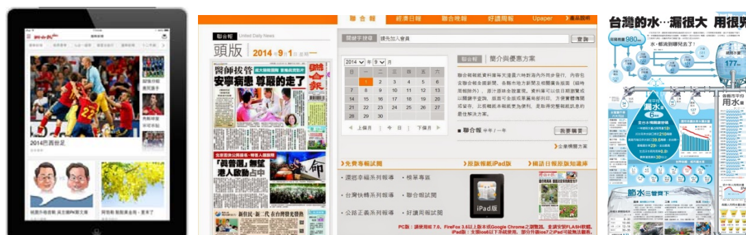
Figure 4, The Innovation Example: iPad UDN plus, News Database, Data Journalism

Both of the WWCH group and UDN group continuously spread new services and diversification. However, WWCH group usually expands through merger and acquisition, but UDN group creates new divisions related to their core value, digital and social media goals. For the past few years, there are many new Apps created for the UDN group. For example, the UDN plus (the interactive news for iPad), UDN News Database including all news and pictures since the year of 1951, and Data Journalism create innovative values based on the original news (Figure 4). Therefore, the revenue ratio of newspaper vs. non-newspaper had changed from 7:3 in 2011 to 5:5 in 2014.