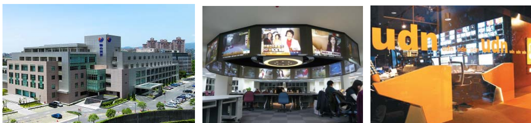
Figure 3, The Space and Location of UDN Group

Because WWCT group expand the diversification through merger and acquisition, therefore most of the media companies were still located in originally different buildings and hard to communicate. On the other hand, in order to fulfill the goals of media convergence, UDN moved all of the divisions to the same building in 2009 (Figure 3). The editors and reporters of the four different newspapers are located in the same room and also share the same news in the editing system.