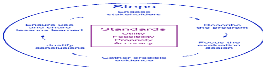
Figure 1: CDC Framework for Program Evaluation in Public Health (1999)

The study adapted the Centers for Diseases Prevention and Control's recommended framework for program evaluation 36 . Stakeholder engagement (i.e., stakeholder analysis and consultation) were crucial steps in the interim assessment of the CARES Project, and this was done as early as the informal planning stage for the study when the principal investigator was being invited by the Philippine Institute of Development Studies (PIDS) to submit a research proposal for the study D . This qualitative study (to the extent possible) espoused the approach of formative evaluation which aimed to support the collective learning of selected project actors (PhilHealth management, CARES project managers, implementers, and staff) in their efforts to improve the delivery of services to PhilHealth members. The assessment focused on describing the organizational context (recruitment, selection, training, deployment of personnel); process of delivery (structures and procedures); on-going implementation activities, and assessing the effectiveness (to the extent possible) and relevance of such activities.