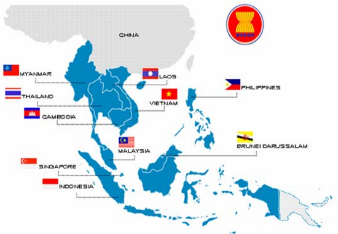
Figure 1. Map of ASEAN

In August 8, 1967, the ASEAN was created to foster cooperation and to promote regional peace and stability through adherence to the principles of the United Nations Charter (ASEAN website). Currently, there are 10-member countries that make up the ASEAN namely Brunei, Cambodia, Indonesia, Laos, Malaysia, Myanmar, the Philippines, Singapore, Thailand, and Vietnam (See Figure 1). ASEAN total population is 604 million (as of 2011) with a working population of at least 263 million (ASEAN Statistics, 2013).