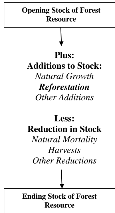
Figure 1: Simplified Illustration of a Forest Resource

Based on the above illustration, other things the same, for a reforestation program to enhance the ending stock of a forest resource, the attained level of reforestation per unit of time should be positive. Furthermore, for a reforestation program to be considered successful ex post, it should have been implemented efficiently and effectively so that its desired outcomes are attained or even surpassed.