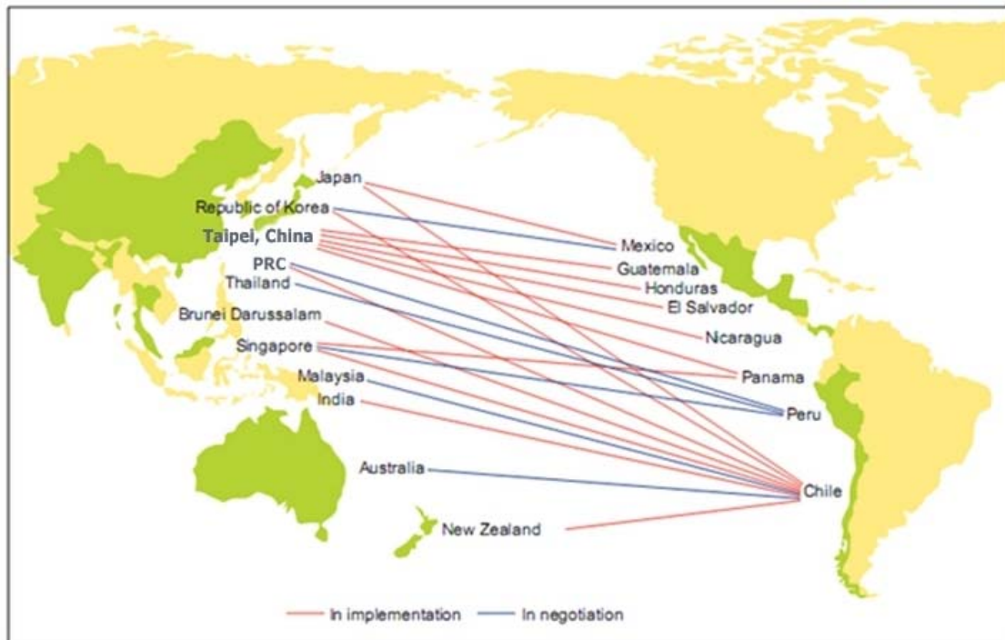
Figure 2: Trans-Pacific Network of FTAs that are Already in Force or in Negotiation

On the whole, the data show that generally, trade and investment relations between East Asia and Latin America are still relatively underdeveloped, leaving room for more coordination and closer trade and investment linkages. There is a growing awareness in both regions of the need and importance to link up, as demonstrated by the growing number of FTAs that have been signed or are being negotiated between the two (Figure 2).