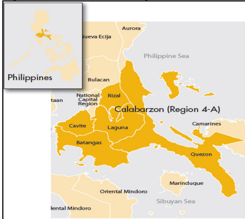
Figure 1. The CALABARZON Region

CALABARZON stands for Cavite, Laguna, Batangas, Rizal and Quezon. These are the five provinces that comprise the CALABARZON region or Region IV-A, one of the 17 regions of the Philippines. The region lies in South Western Luzon, just south west of the National Capital Region. The table below shows the estimated distance of each province from Metro Manila. Of the five provinces, Rizal is the closest with just some 20 kilometers east of Metro Manila.