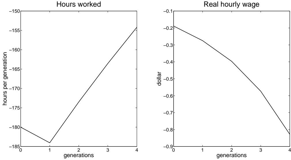
Figure 2: Impulse response of hours worked and real wages to a permanent increase in the payroll tax rate by one percentage point.

values) is due to the direct effect. The change in the payroll tax rate has a direct consumption equivalent effect of 0.95% for the initial old generation. The corresponding direct effect for the initial young and the future generations is negative. Thus, receiving more transfers when retired does not fully compensate for having to pay more taxes when working. This result matches the data which indicate that the US economy is dynamically efficient. Second, the factor price effect is substantial. For all generations, this effect amounts to about 60% of the direct effect's size. Note that the factor price effect is of the same sign and, hence, amplifies the direct effect. The factor price effect can be further decomposed into the effect due to changes of wages when young, wages when old and interest rates. This decomposition reveals that changes in the interest rate and changes in the wage level during the working age are important. In contrast, changes in the wage level when retired, which affect the level of transfers paid to retirees, are of minor importance. Third, the payroll tax change has a negative impact on labor and therefore on transfers, but this labor effect seems to be of minor quantitative relevance.