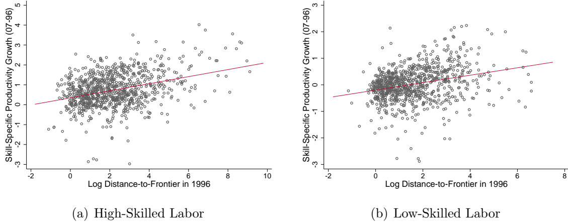
Figure 2: Distance-to-Frontier and Long-Run Productivity Growth

Notes: Both figures display on the x-axis the skill-specific log distance-to-frontier in 1996 of country-industry observations ( \ln(A_{k96}^F/A_{ki96}) ). The y-axis shows the skill-specific productivity growth rate between 1996 and 2007 ( \ln(A_{ki07}) - \ln(A_{ki96}) ). The sample consists of all country-industry observations available in 2007 and 1996.