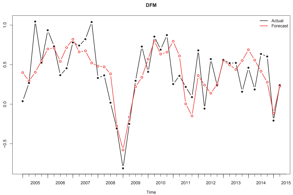
(b) Dynamic factor model of Siliverstovs and Kholodilin (2012)