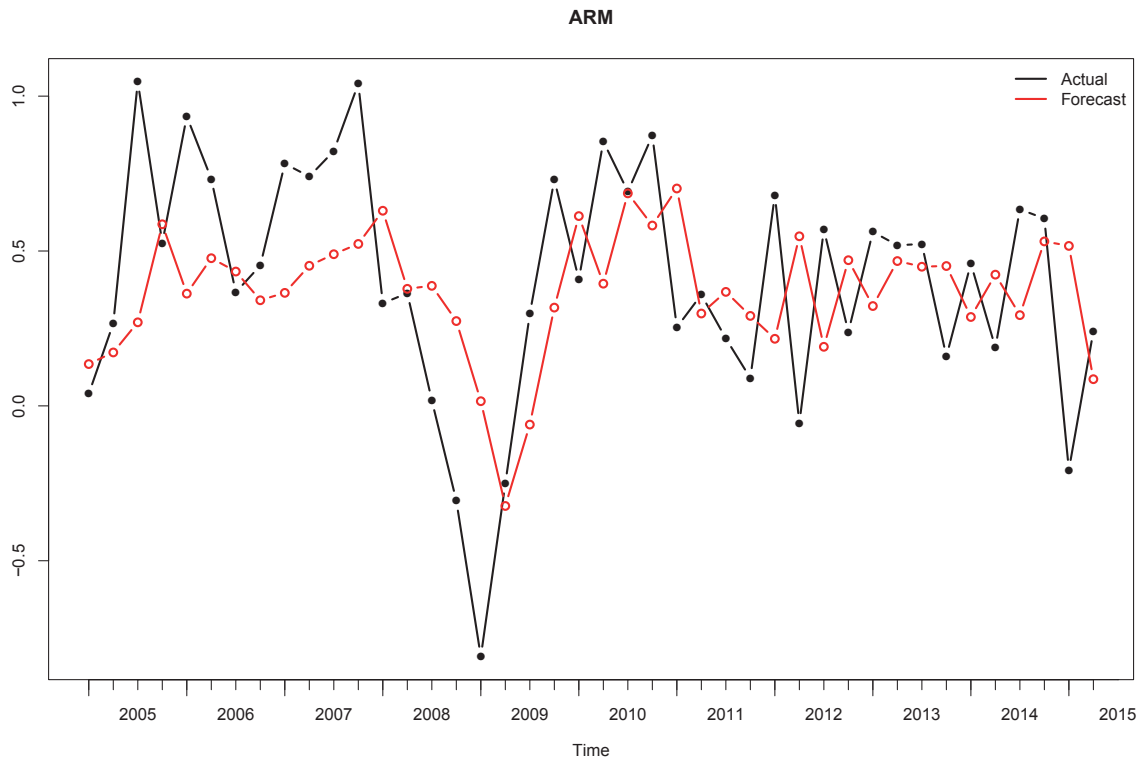
(a) Benchmark AR(1) model